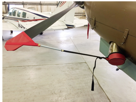
Siai Marchetti 1019 Prop Tie-Exhaust Covers