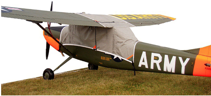
L-19 Canopy Cover (similar to Siai Marchetti 1019)

This cover type is made from Silver Acrylic Sunbrella canvas and is 100% lined with a soft and smooth microfiber. Bruce's Custom Covers developed this material combination especially for aircraft protection. The outer material is medium weight and treated for water resistance, UV resistance and anti-static buildup. The inner lining is a very soft and smooth microfiber to prevent scratching. The material is very reflective, and tests show that the cabin interior temperature can be reduced to near-ambient temperature on the hottest of days. It is water, ice and snow repellent, yet breathable to allow moisture to escape from between the cover and the aircraft surface.