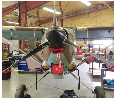
Siai Marchetti 1019 Engine Plugs, Prop Tie-Exhaust Covers