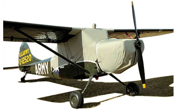
Cessna L-19 Canopy & Engine Covers (similar to Siai Marchetti 1019)