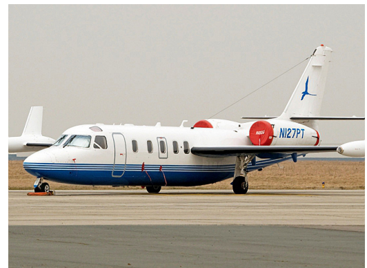
Engine Covers & Cockpit HeatShields