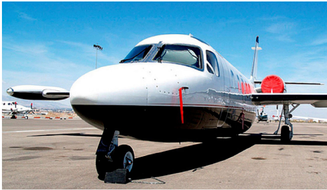
Westwind Engine Cover Set, Pitot Cover

The Israel Aircraft Westwind 1123 Bikini Style Engine Covers are a single-piece design using a soft and smooth stretchy and fabric. The cover stretches tightly over both the intake and exhaust, installing quickly and easily. These covers are designed to be used as hangar dust covers and have a useful life of approximately one year.