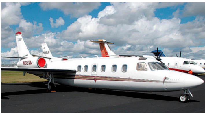
Westwind Engine Intake Plugs