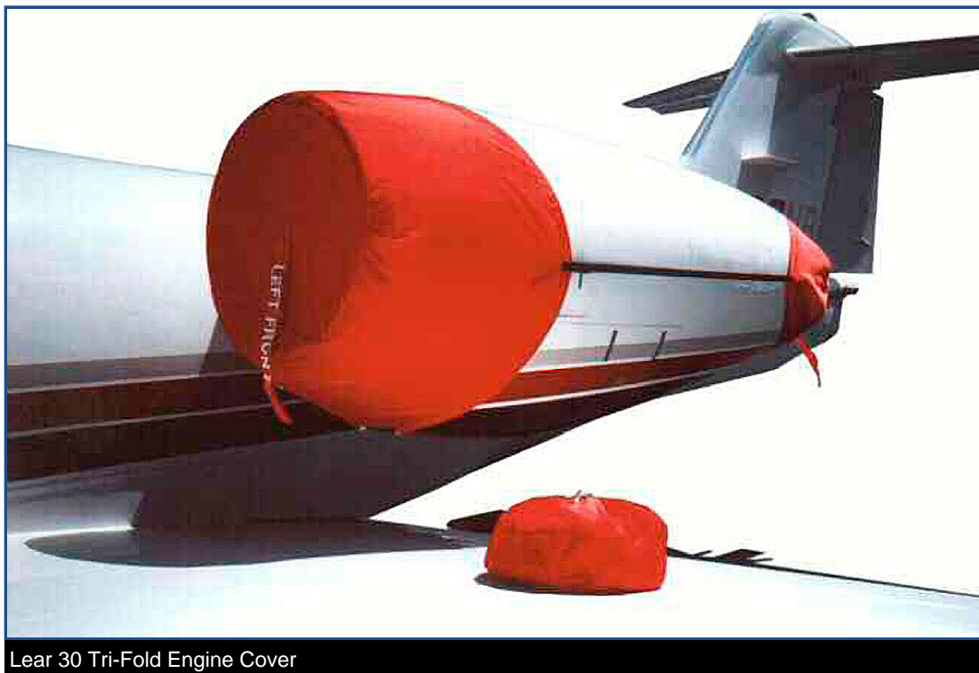
Lear 30 Tri-Fold Engine Cover