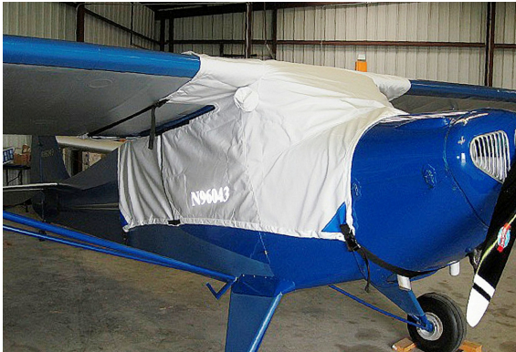
Taylorcraft BC12-D Over-the-top Canopy Cover

This cover type is made from Silver Acrylic Sunbrella canvas and is 100% lined with a soft and smooth microfiber. Bruce's Custom Covers developed this material combination especially for aircraft protection. The outer material is medium weight and treated for water resistance, UV resistance and anti-static buildup. The inner lining is a very soft and smooth microfiber to prevent scratching. The material is very reflective, and tests show that the cabin interior temperature can be reduced to near-ambient temperature on the hottest of days. It is water, ice and snow repellent, yet breathable to allow moisture to escape from between the cover and the aircraft surface.