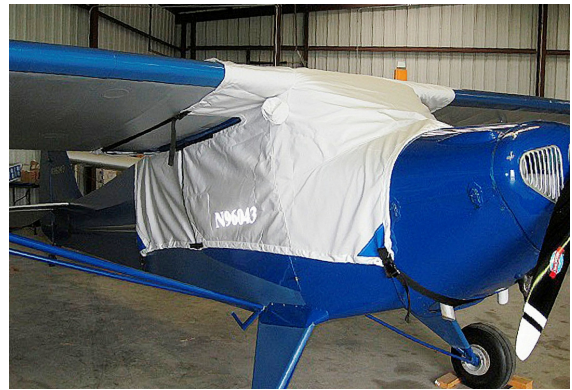
Taylorcraft BC12-D Over-the-top Canopy Cover