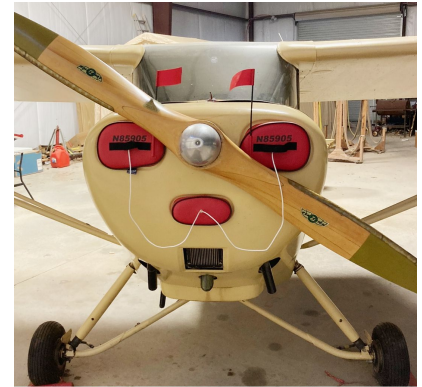
Aeronca 11CC Super Chief Engine Plugs, Extended Canopy Cover (also covers gas caps) Aeronca 11AC Chief Engine Plugs