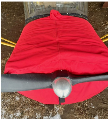
Aeronca 11AC Chief Insulated Engine Cover

This cover type is made from Silver Acrylic Sunbrella canvas and is 100% lined with a soft and smooth microfiber. Bruce's Custom Covers developed this material combination especially for aircraft protection. The outer material is medium weight and treated for water resistance, UV resistance and anti-static buildup. The inner lining is a very soft and smooth microfiber to prevent scratching. The material is very reflective, and tests show that the cabin interior temperature can be reduced to near-ambient temperature on the hottest of days. It is water, ice and snow repellent, yet breathable to allow moisture to escape from between the cover and the aircraft surface.