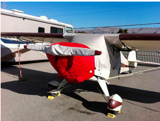
Taylorcraft Insulated Engine Cover, Prop and Canopy Covers

This cover type is made from Silver Acrylic Sunbrella canvas and is 100% lined with a soft and smooth microfiber. Bruce's Custom Covers developed this material combination especially for aircraft protection. The outer material is medium weight and treated for water resistance, UV resistance and anti-static buildup. The inner lining is a very soft and smooth microfiber to prevent scratching. The material is very reflective, and tests show that the cabin interior temperature can be reduced to near-ambient temperature on the hottest of days. It is water, ice and snow repellent, yet breathable to allow moisture to escape from between the cover and the aircraft surface.