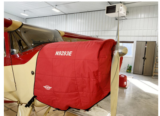
Aeronca 11AC Chief Insulated Engine Cover