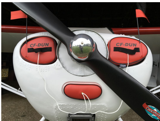
Aeronca 11AC Engine Inlet Plugs

Engine Inlet Plugs are custom fit for your Aeronca Chief 11AC, Super Chief 11CC intakes, made with heavy-duty vinyl material, and stuffed with a single block of sculpted urethane foam. Each plug has a zipper that allows the foam to be removed and dried if necessary. Engine plugs have warning flags that are visible from the cockpit or 'remove before flight' streamers sewn onto the face of the plugs. Most plugs are imprinted with the aircraft registration number in black for an extra charge. Storage bag NOT included. Engine plugs may be inserted after flight when the engine is still warm. Engine Inlet Plugs are commonly referred to as Cowl Plugs, Intake Plugs, Cowl Blocks, Engine Blocks, and Engine Bungs.