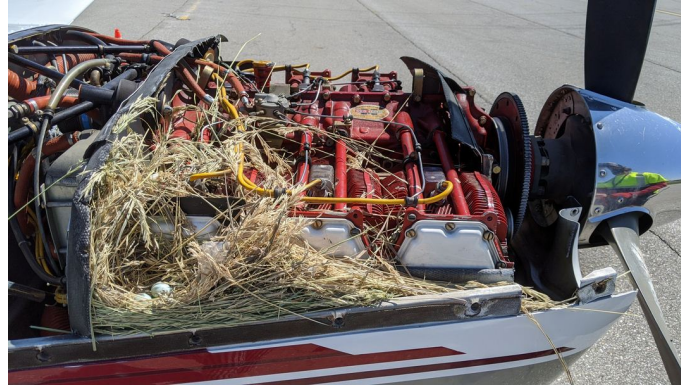
Aeronca 11AC Engine Inlet Plugs