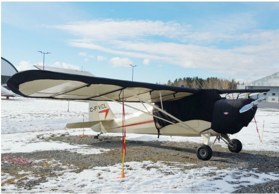
Aeronca Chief 11AC Canopy, Insulated Engine, & Wing Covers

WINTER USE MATERIAL - Made with Solution-Dyed Polyester fabric, this option is intended for seasonal use to aid in deicing, rain mitigation, or for occasional travel. The material is lighter and more compact, but more susceptible to UV damage and may have a shorter useful life if used continuously outside than the all-year use material.