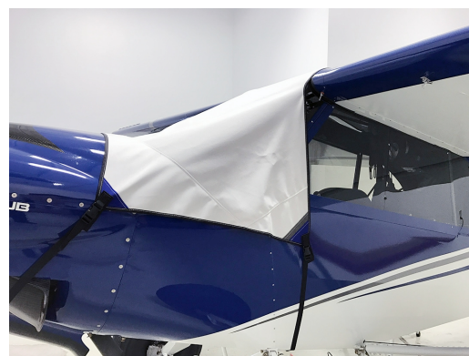
Cub Crafters CC-11 Windshield Cover