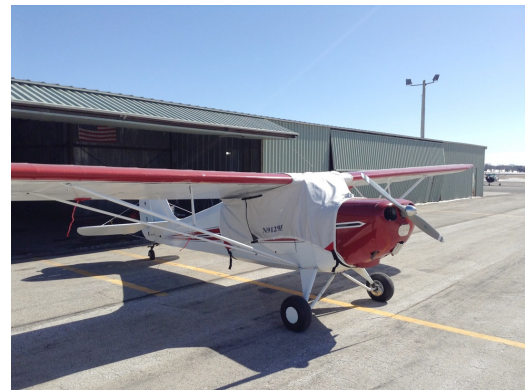
Aeronca Chief Canopy Cover