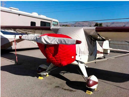
Taylorcraft Insulated Engine Cover, Prop and Canopy Covers

This cover type is made from Silver Acrylic Sunbrella canvas and is 100% lined with a soft and smooth microfiber. Bruce's Custom Covers developed this material combination especially for aircraft protection. The outer material is medium weight and treated for water resistance, UV resistance and anti-static buildup. The inner lining is a very soft and smooth microfiber to prevent scratching. The material is very reflective, and tests show that the cabin interior temperature can be reduced to near-ambient temperature on the hottest of days. It is water, ice and snow repellent, yet breathable to allow moisture to escape from between the cover and the aircraft surface.