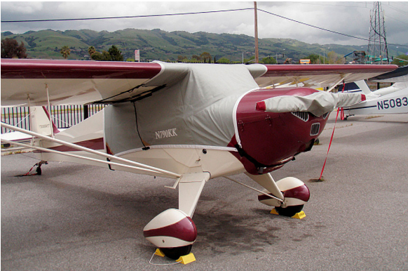
Taylorcraft Over-Top Canopy Cover