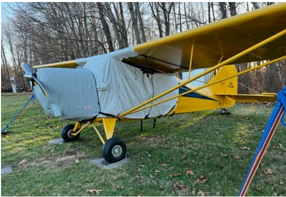
Aeronca Chief 11BC Extended Over-Top Canopy Cover