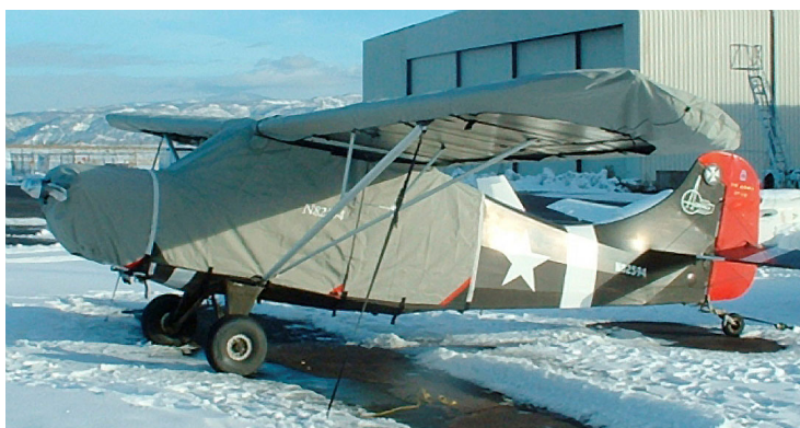
Extended Canopy Cover, Engine & Wing Covers

This cover type is made from Silver Acrylic Sunbrella canvas and is 100% lined with a soft and smooth microfiber. Bruce's Custom Covers developed this material combination especially for aircraft protection. The outer material is medium weight and treated for water resistance, UV resistance and anti-static buildup. The inner lining is a very soft and smooth microfiber to prevent scratching. The material is very reflective, and tests show that the cabin interior temperature can be reduced to near-ambient temperature on the hottest of days. It is water, ice and snow repellent, yet breathable to allow moisture to escape from between the cover and the aircraft surface.