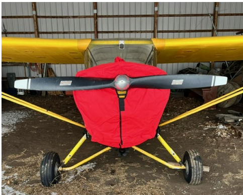
Aeronca 11AC Chief Insulated Engine Cover