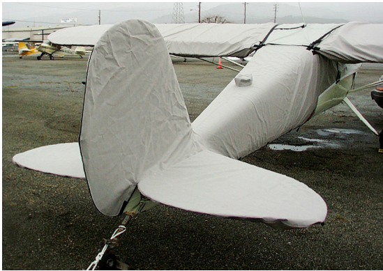
Cessna 120 Empennage Cover

WINTER USE MATERIAL - Made with Solution-Dyed Polyester fabric, this option is intended for seasonal use to aid in deicing, rain mitigation, or for occasional travel. The material is lighter and more compact, but more susceptible to UV damage and may have a shorter useful life if used continuously outside than the all-year use material.