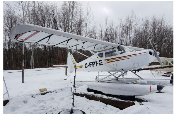
Christavia Mk 1 Wing Covers