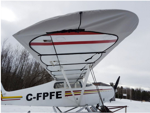
Christavia Mk 1 Wing Covers