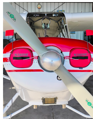
Aeronca 7AC Engine Inlet Plugs