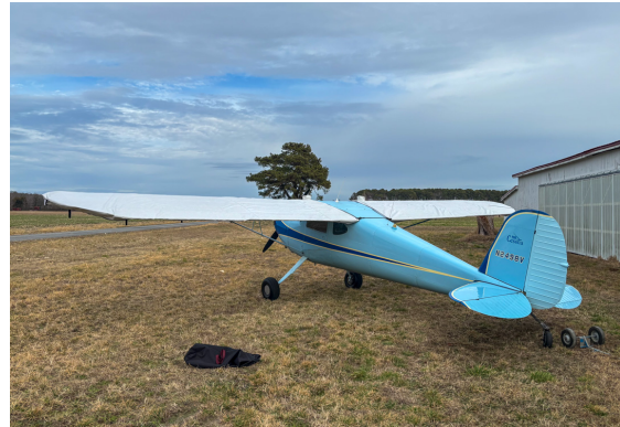
Cessna 140 Wing Covers, All Year Use, specify fabric wings (set of 2)