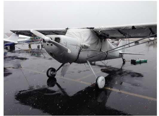
Cessna 120/140 Canopy and Wing Covers