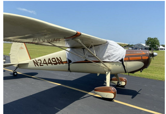
Cessna 140 Over-Top Canopy Cover