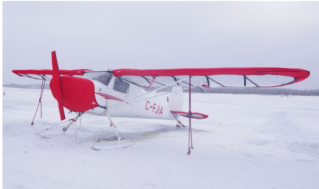
Cessna 120 Insulated Engine & Prop Covers, Wing & Tail Covers

WINTER USE MATERIAL - Made with Solution-Dyed Polyester fabric, this option is intended for seasonal use to aid in deicing, rain mitigation, or for occasional travel. The material is lighter and more compact, but more susceptible to UV damage and may have a shorter useful life if used continuously outside than the all-year use material.