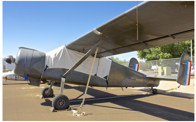
Broussard Canopy Cover