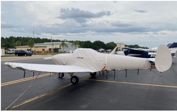
Ercoupe Complete Cover Set