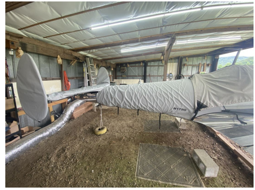
Ercoupe Empennage Cover