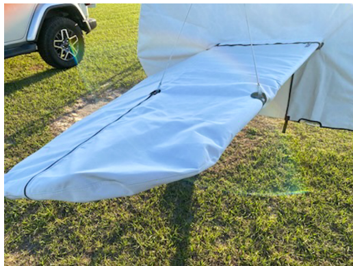
Aeronca Sedan Empennage Cover (Tailboom, Vertical & Horiz Stabilizers), All Year Use

shorter useful life if used continuously outside than the all-year use material.