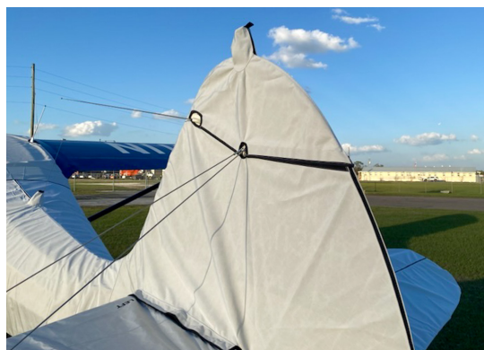
Aeronca Sedan Empennage Cover (Tailboom, Vertical & Horiz Stabilizers), All Year Use