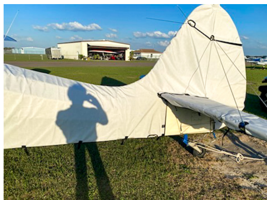
Aeronca Sedan Empennage Cover (Tailboom, Vertical & Horiz Stabilizers), All Year Use

WINTER USE MATERIAL - Made with Solution-Dyed Polyester fabric, this option is intended for seasonal use to aid in deicing, rain mitigation, or for occasional travel. The material is lighter and more compact, but more susceptible to UV damage and may have a shorter useful life if used continuously outside than the all-year use material.