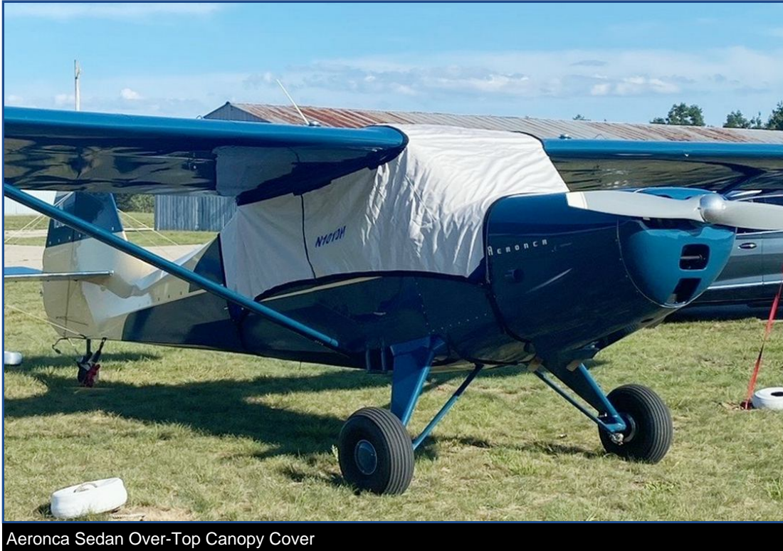
Aeronca Sedan Over-Top Canopy Cover