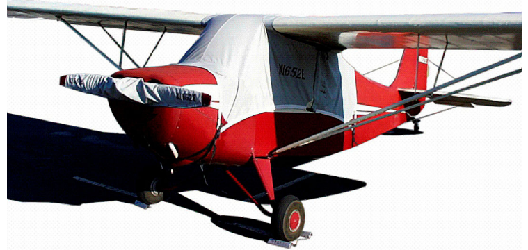
Aeronca Champ Canopy & Prop Covers