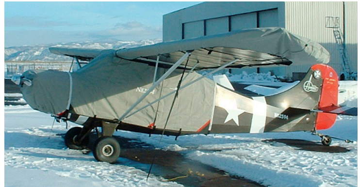
Extended Canopy Cover, Engine & Wing Covers