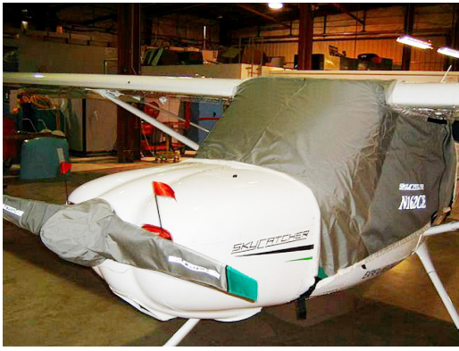
Cessna Skycatcher Standard Canopy Cover, Propellor Cover & Engine Inlet Plugs