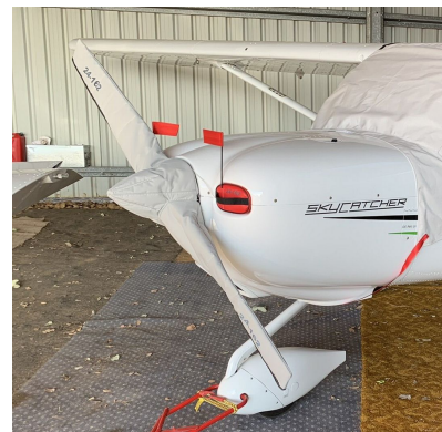
Cessna Skycatcher Prop/Spinner Cover, Engine Plugs