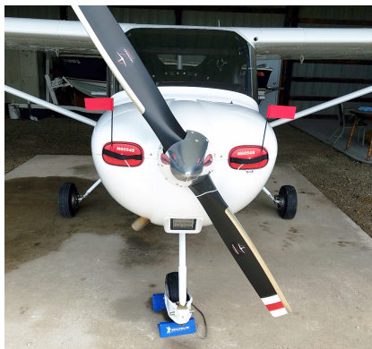
Cessna Skycatcher 162 Engine Inlet Plugs

Engine Inlet Plugs are custom fit for your Cessna Skycatcher 162 intakes, made with heavy-duty vinyl material, and stuffed with a single block of sculpted urethane foam. Each plug has a zipper that allows the foam to be removed and dried if necessary. Engine plugs have warning flags that are visible from the cockpit or 'remove before flight' streamers sewn onto the face of the plugs. Most plugs are imprinted with the aircraft registration number in black for an extra charge. Storage bag NOT included. Engine plugs may be inserted after flight when the engine is still warm. Engine Inlet Plugs are commonly referred to as Cowl Plugs, Intake Plugs, Cowl Blocks, Engine Blocks, and Engine Bungs.