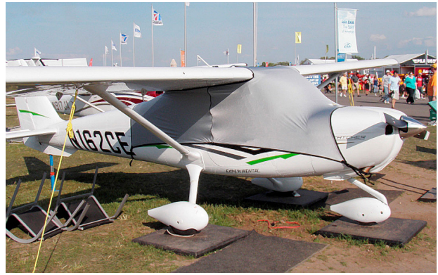
Cessna Skycatcher Spandex FlyAway Travel Cover