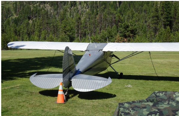
Cessna 170 Wing Covers (1948, Fabric Type, Round Tip), All Year Use

WINTER USE MATERIAL - Made with Solution-Dyed Polyester fabric, this option is intended for seasonal use to aid in deicing, rain mitigation, or for occasional travel. The material is lighter and more compact, but more susceptible to UV damage and may have a shorter useful life if used continuously outside than the all-year use material.