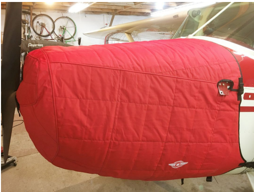
Cessna 170 Insulated Engine Cover