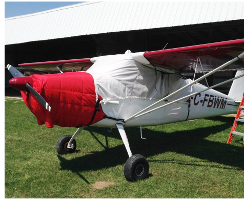
Cessna 170 Over-Top Canopy Cover, Insulated Engine Cover