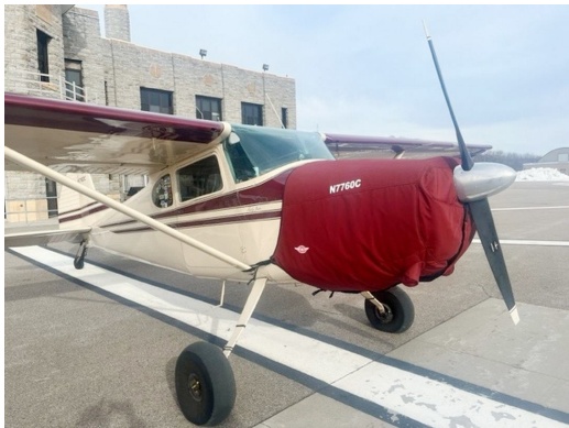
Cessna 170B Insulated Engine Cover

This cover type is made from Silver Acrylic Sunbrella canvas and is 100% lined with a soft and smooth microfiber. Bruce's Custom Covers developed this material combination especially for aircraft protection. The outer material is medium weight and treated for water resistance, UV resistance and anti-static buildup. The inner lining is a very soft and smooth microfiber to prevent scratching. The material is very reflective, and tests show that the cabin interior temperature can be reduced to near-ambient temperature on the hottest of days. It is water, ice and snow repellent, yet breathable to allow moisture to escape from between the cover and the aircraft surface.