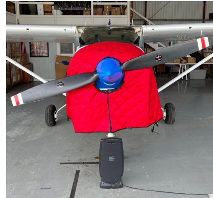
Insulated Hangar Blanket on Cessna 182