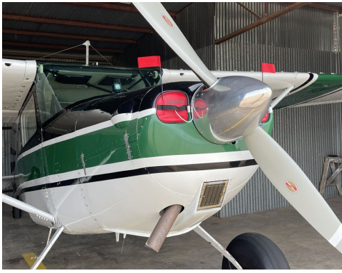
Cessna 170B Engine Inlet Plugs (B Model) Includes Carb Inlet Plug