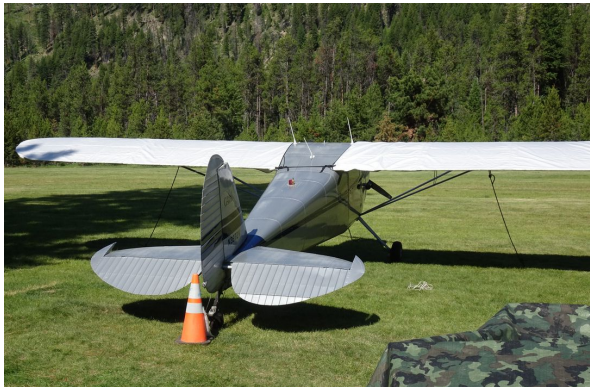
Cessna 170 Wing Covers