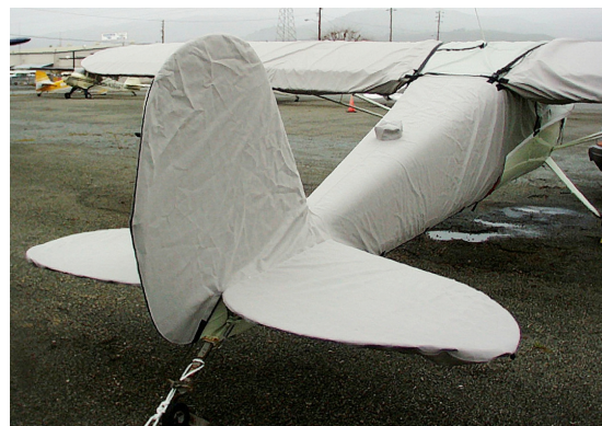
Cessna 120 Empennage Cover