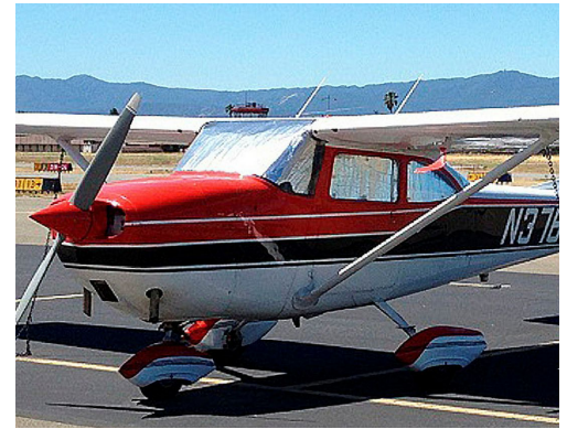
Cessna 172 Cabin HeatShields