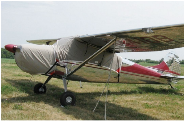
Cessna 170B Canopy & Engine Covers