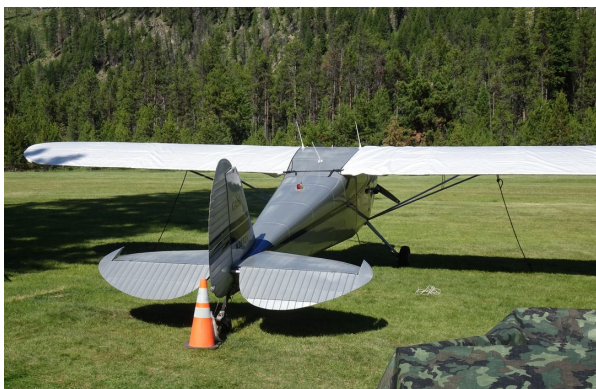
Cessna 170 Wing Covers (1948, Fabric Type, Round Tip), All Year Use

WINTER USE MATERIAL - Made with Solution-Dyed Polyester fabric, this option is intended for seasonal use to aid in deicing, rain mitigation, or for occasional travel. The material is lighter and more compact, but more susceptible to UV damage and may have a shorter useful life if used continuously outside than the all-year use material.