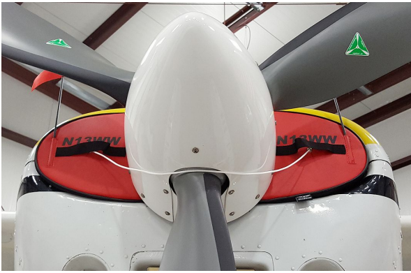
Cessna 180/185 Skywagon Engine Inlet Plugs