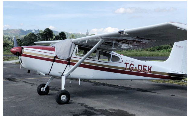
Cessna 180 Windshield Cover