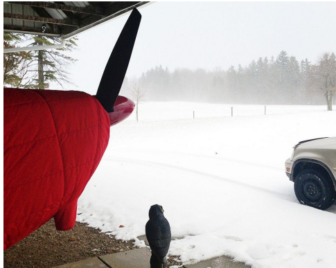
Winter in Canada

This cover type is made from Silver Acrylic Sunbrella canvas and is 100% lined with a soft and smooth microfiber. Bruce's Custom Covers developed this material combination especially for aircraft protection. The outer material is medium weight and treated for water resistance, UV resistance and anti-static buildup. The inner lining is a very soft and smooth microfiber to prevent scratching. The material is very reflective, and tests show that the cabin interior temperature can be reduced to near-ambient temperature on the hottest of days. It is water, ice and snow repellent, yet breathable to allow moisture to escape from between the cover and the aircraft surface.