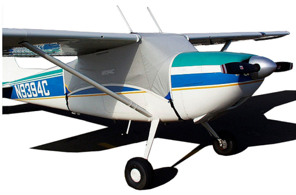
Cessna 180 Canopy Cover