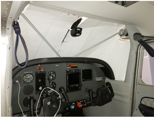
Cessna 180 Skywagon Windshield Heatshield, (W/ Compass)

Windshield Heatshields are interior sunshades for an aircraft's front windshield. The product is a unique composite of closed-cell foam with a silver mylar finish. The semi-rigid design is stiff enough to stand along the inside of the windshield using sun visors or window framing. It folds up flat and easily stores in the included storage sleeve. Some designs may require velcro and suction cups or split right and left sides. A Heatshield is an excellent short-term remedy for cockpit overheating. An external fabric cover is far more effective and practical for long-term protection.