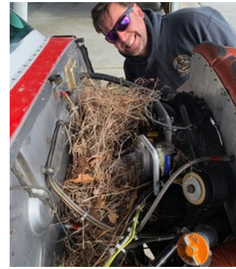
Cessna 172 Bird Nest Problem