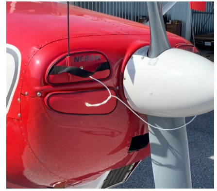
Cessna 170 Engine Plugs