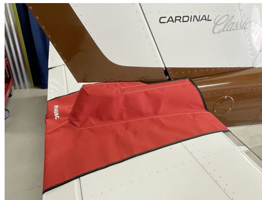
Cessna 177 Cardinal Tailcone Cover, Fully Enclosed