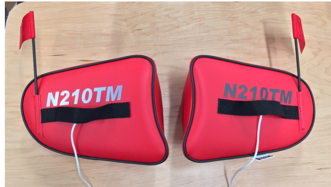
Cessna 210 Engine Inlet Plugs