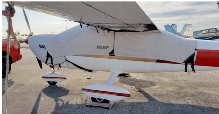
Cessna 177 Cardinal Insulated Engine Cover Cessna Cardinal 177 Engine Cover & Over-Top Canopy Cover with Wing Extensions