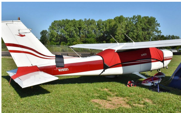
Cessna Cardinal C-177 Tailcone Cover custom color in Red