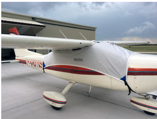
Cessna 177 Cardinal Canopy Cover, Wrap-Around Type

This cover type is made from Silver Acrylic Sunbrella canvas and is 100% lined with a soft and smooth microfiber. Bruce's Custom Covers developed this material combination especially for aircraft protection. The outer material is medium weight and treated for water resistance, UV resistance and anti-static buildup. The inner lining is a very soft and smooth microfiber to prevent scratching. The material is very reflective, and tests show that the cabin interior temperature can be reduced to near-ambient temperature on the hottest of days. It is water, ice and snow repellent, yet breathable to allow moisture to escape from between the cover and the aircraft surface.