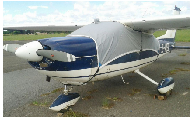
Cessna 177 Cardinal Travel Canopy Cover