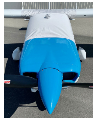
Cessna Cardinal 177 Over-Top Canopy Cover