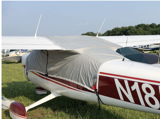
Cessna 177 Cardinal Lightweight Travel Canopy Cover

Travel Covers are made with Silver Solution-Dyed Polyester fabric and only lined over the windshield to save weight. The material is lightweight and more compact for easy stowage in the aircraft. The polyester material is water resistant, but only intended for occasional use outside. We also have an ultra lightweight material available for fitted hangar dust covers. For daily outdoor use, the non-travel Sunbrella Cover is the best choice.