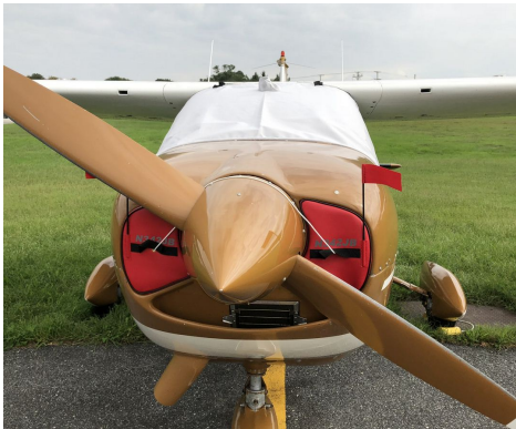
1968 Cessna 177 Engine Inlet Plugs

Engine Inlet Plugs are custom fit for your Cessna 177 Cardinal intakes, made with heavy-duty vinyl material, and stuffed with a single block of sculpted urethane foam. Each plug has a zipper that allows the foam to be removed and dried if necessary. Engine plugs have warning flags that are visible from the cockpit or 'remove before flight' streamers sewn onto the face of the plugs. Most plugs are imprinted with the aircraft registration number in black for an extra charge. Storage bag NOT included. Engine plugs may be inserted after flight when the engine is still warm. Engine Inlet Plugs are commonly referred to as Cowl Plugs, Intake Plugs, Cowl Blocks, Engine Blocks, and Engine Bungs.