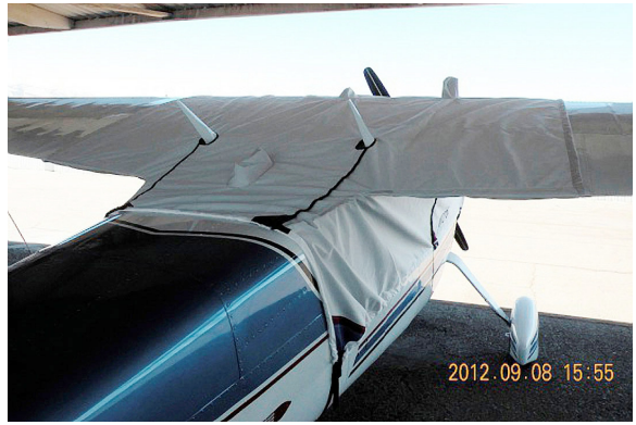
Cessna 195 Over-Top Canopy Cover with underbelly gap seal, & Engine Inlet Plugs