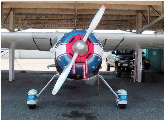
Cessna 195 Engine Inlet Plugs, set of 3