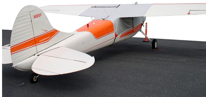
Cessna 195 Over-Top Canopy, Engine & Prop Covers