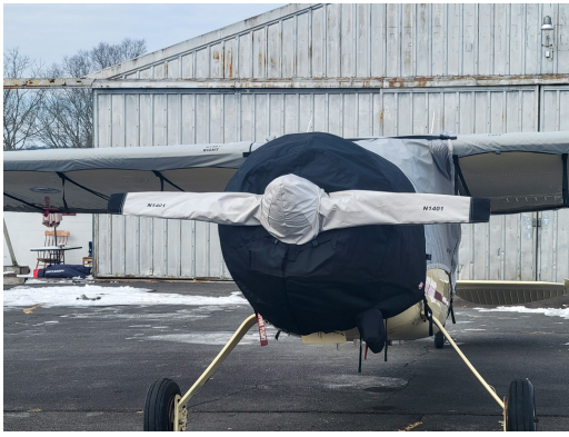
Cessna 190 Travel Canopy, Insulated Engine, Wing & Prop Covers