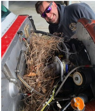
Cessna 172 Bird Nest Problem

Engine Inlet Plugs are custom fit for your Cessna 190 & 195 intakes, made with heavy-duty vinyl material, and stuffed with a single block of sculpted urethane foam. Each plug has a zipper that allows the foam to be removed and dried if necessary. Engine plugs have warning flags that are visible from the cockpit or 'remove before flight' streamers sewn onto the face of the plugs. Most plugs are imprinted with the aircraft registration number in black for an extra charge. Storage bag NOT included. Engine plugs may be inserted after flight when the engine is still warm. Engine Inlet Plugs are commonly referred to as Cowl Plugs, Intake Plugs, Cowl Blocks, Engine Blocks, and Engine Bungs.