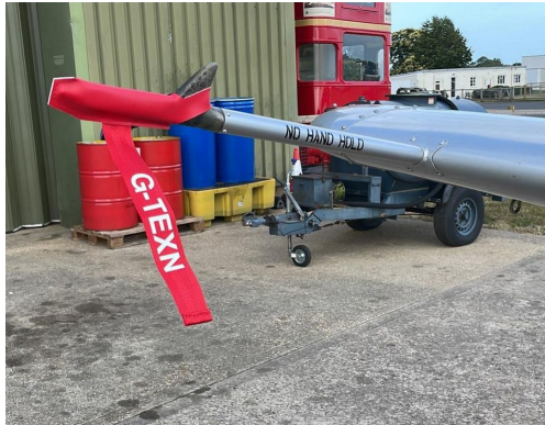
T6 Harvard Pitot Cover, shark fin type

Engine Inlet Plugs are custom fit for your Cessna 190 & 195 intakes, made with heavy-duty vinyl material, and stuffed with a single block of sculpted urethane foam. Each plug has a zipper that allows the foam to be removed and dried if necessary. Engine plugs have warning flags that are visible from the cockpit or 'remove before flight' streamers sewn onto the face of the plugs. Most plugs are imprinted with the aircraft registration number in black for an extra charge. Storage bag NOT included. Engine plugs may be inserted after flight when the engine is still warm. Engine Inlet Plugs are commonly referred to as Cowl Plugs, Intake Plugs, Cowl Blocks, Engine Blocks, and Engine Bungs.