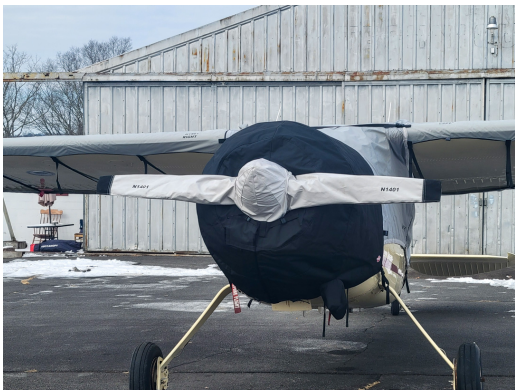
Cessna 190 Travel Canopy, Insulated Engine, Wing & Prop Covers

WINTER USE MATERIAL - Made with Solution-Dyed Polyester fabric, this option is intended for seasonal use to aid in deicing, rain mitigation, or for occasional travel. The material is lighter and more compact, but more susceptible to UV damage and may have a shorter useful life if used continuously outside than the all-year use material.