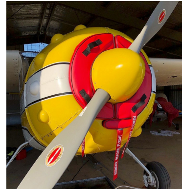
Cessna 195 Engine Plugs