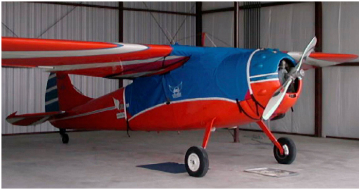
Cessna 195 Canopy Cover, extended forward and over gas caps