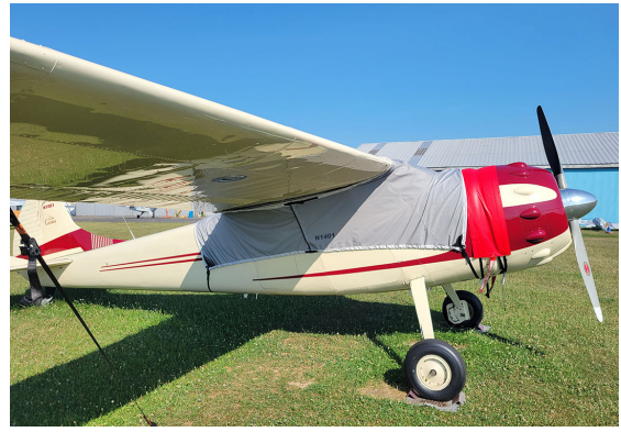
Cessna 190 Travel Cover, Light Weight Canopy Cover, Over-Top Type