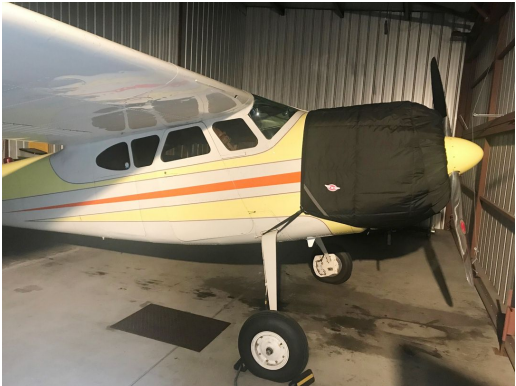
Cessna 195B Insulated Engine Cover