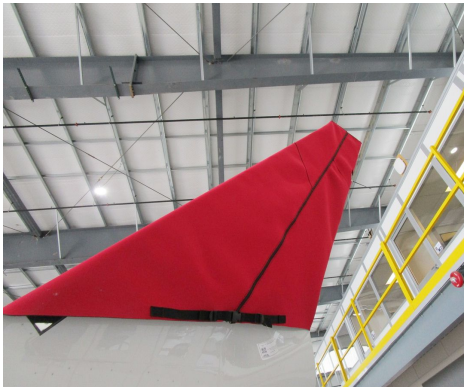
Bombardier Global Express Padded Winglet Covers