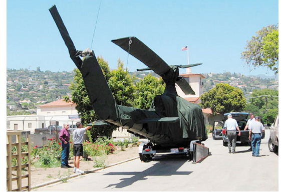
Bell 204/205 Full Body Cover Set