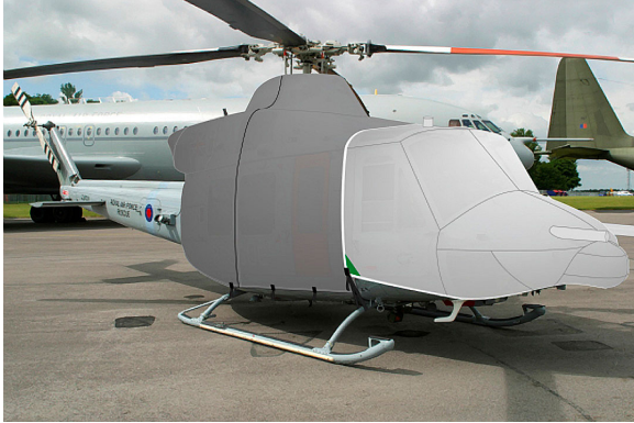
Forward Cabin Nose & Mid-Cabin/Engine Cover (extended to cross tubes)

This cover type is made from Silver Acrylic Sunbrella canvas and is 100% lined with a soft and smooth microfiber. Bruce's Custom Covers developed this material combination especially for aircraft protection. The outer material is medium weight and treated for water resistance, UV resistance and anti-static buildup. The inner lining is a very soft and smooth microfiber to prevent scratching. The material is very reflective, and tests show that the cabin interior temperature can be reduced to near-ambient temperature on the hottest of days. It is water, ice and snow repellent, yet breathable to allow moisture to escape from between the cover and the aircraft surface.