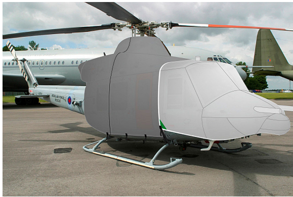
Forward Cabin Nose & Mid-Cabin/Engine Cover (extended to cross tubes)

WINTER USE MATERIAL - Made with Solution-Dyed Polyester fabric, this option is intended for seasonal use to aid in deicing, rain mitigation, or for occasional travel. The material is lighter and more compact, but more susceptible to UV damage and may have a shorter useful life if used continuously outside than the all-year use material.