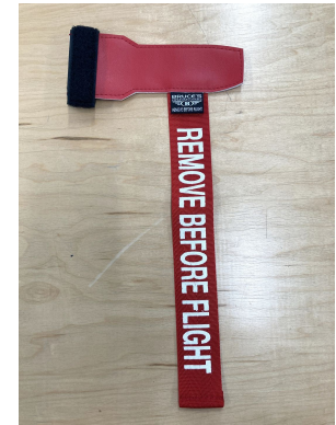
Pitot Tube Cover