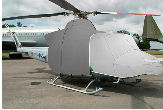
Forward Cabin Nose & Mid-Cabin/Engine Cover (extended to cross tubes)

The material is very reflective, and tests show that the cabin interior temperature can be reduced to near-ambient temperature on the hottest of days. It is water, ice and snow repellent, yet breathable to allow moisture to escape from between the cover and the aircraft surface.