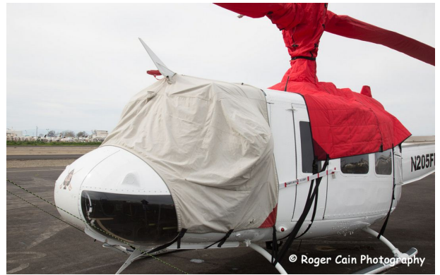
Bell 205 Engine, Rotor Mast, Blades & Forward Cabin Covers