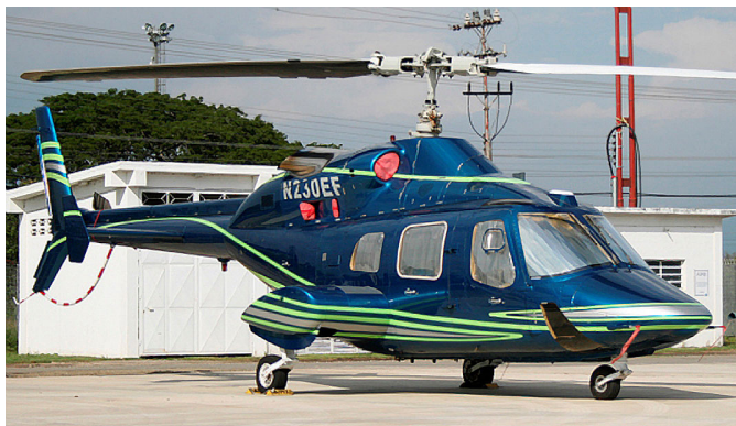
Bell 230 Engine Plugs, HeatShields

Heatshields are interior sunshades for an aircraft's windows or canopy glass. The product is a unique composite of closed-cell foam with a silver mylar finish. The semi-rigid design is stiff enough to stand along the inside of the windshield using sun visors or window framing. It folds up flat and easily stores in the included storage sleeve. Some designs may require velcro and suction cups. A Heatshield is an excellent short-term remedy for cockpit overheating.