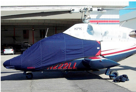
Bell 222 Bubble Cover

This cover type is made from Silver Acrylic Sunbrella canvas and is 100% lined with a soft and smooth microfiber. Bruce's Custom Covers developed this material combination especially for aircraft protection. The outer material is medium weight and treated for water resistance, UV resistance and anti-static buildup. The inner lining is a very soft and smooth microfiber to prevent scratching. The material is very reflective, and tests show that the cabin interior temperature can be reduced to near-ambient temperature on the hottest of days. It is water, ice and snow repellent, yet breathable to allow moisture to escape from between the cover and the aircraft surface.