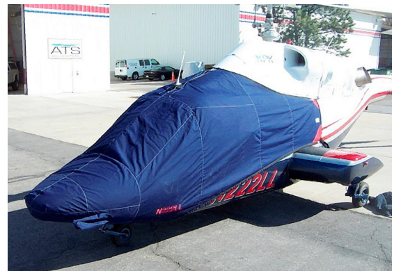
Bell 222 Bubble Cover