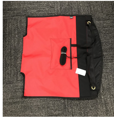
Bell 230 Blade Tie-Downs, (Semi-Rigid) W/Telescoping Attachment Handle