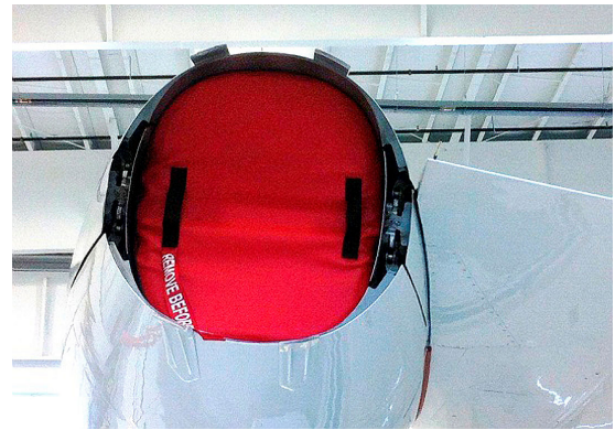
Falcon 2000EX Exhaust Plug