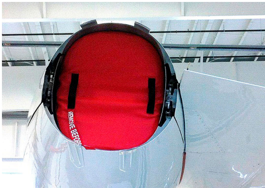
Falcon 2000EX Exhaust Plug