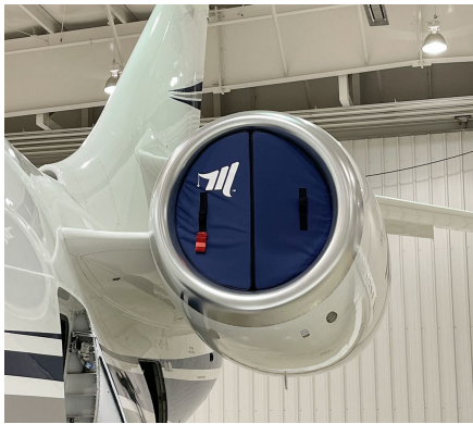
Falcon Jet Engine Inlet Plugs Folding Type

The Engine Inlet Plugs are custom fit for your Falcon Jet 2000EX, 2000LXS intakes, made with heavy-duty vinyl material, and stuffed with a single block of sculpted urethane foam. Each plug has a zipper that allows the foam to be removed and dried if necessary. Engine plugs have 'remove before flight' streamers sewn onto the face of the plugs. Most plugs are imprinted with the aircraft registration number in black for an extra charge. Storage bag NOT included. Engine plugs may be inserted after flight when the engine is still warm. Engine Inlet Plugs are commonly referred to as Cowl Plugs, Intake Plugs, Cowl Blocks, Engine Blocks, and Engine Bungs.