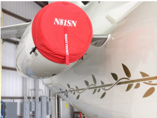
Falcon 900EX Intake Cover