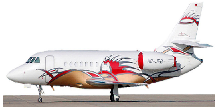
Falcon 2000EX Engine Cover Set, OEM Design