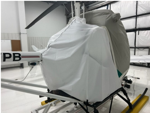
Schweizer 300C Engine Cover, test fit cover

WINTER USE MATERIAL - Made with Solution-Dyed Polyester fabric, this option is intended for seasonal use to aid in deicing, rain mitigation, or for occasional travel. The material is lighter and more compact, but more susceptible to UV damage and may have a shorter useful life if used continuously outside than the all-year use material.