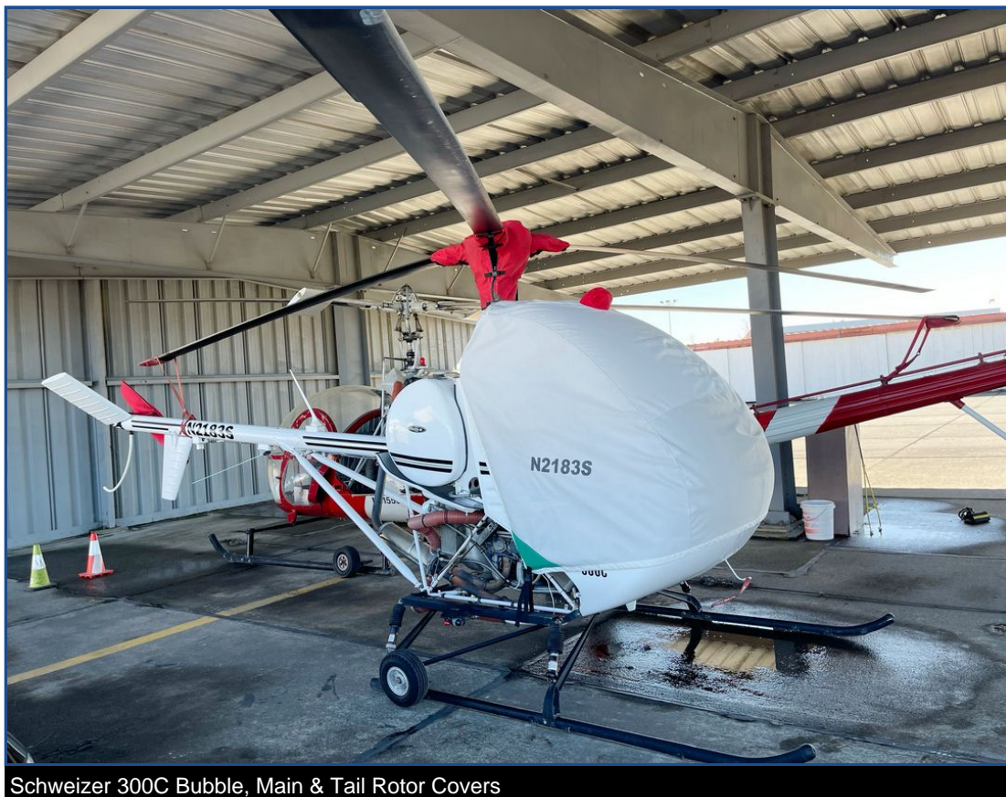
Schweizer 300C Bubble, Main &amp; Tail Rotor Covers