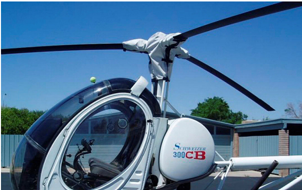
Hughes 300 Main Rotor Cover