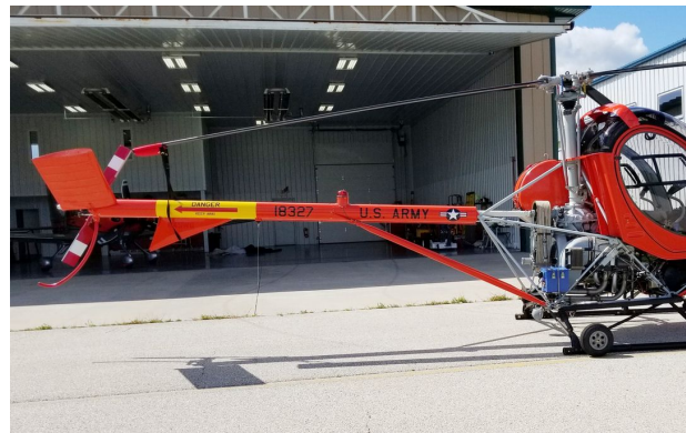
Schweizer (Hughes) 269, 300C, 300CB (TH-55) Rear Blade Tie-Down