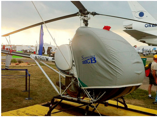
Schweizer 300CB Bubble Cover