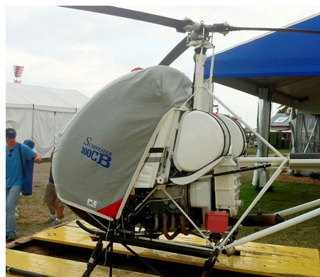
Schweizer 300CB Bubble Cover