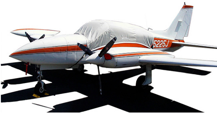
Cessna 310Q Canopy Cover