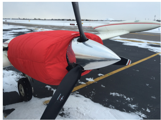
Cessna 310 Insulated Engine Cover