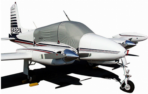
Cessna 310A Canopy Cover