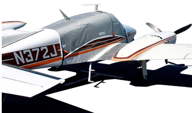
Cessna 320 Canopy Cover

Travel Covers are made with Silver Solution-Dyed Polyester fabric and only lined over the windshield to save weight. The material is lightweight and more compact for easy stowage in the aircraft. The polyester material is water resistant, but only intended for occasional use outside. We also have an ultra lightweight material available for fitted hangar dust covers. For daily outdoor use, the non-travel Sunbrella Cover is the best choice.