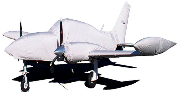
Cessna 310 Complete Cover Set