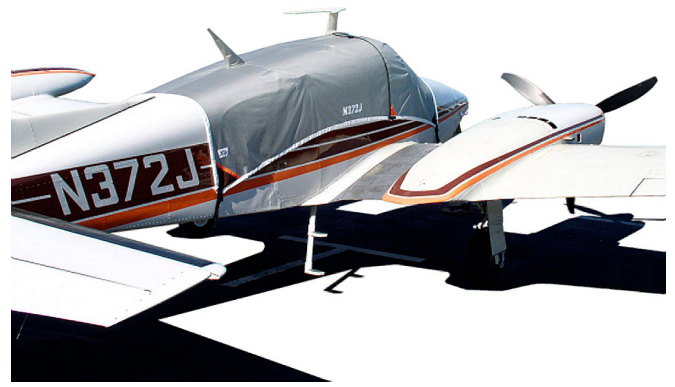
Cessna 320 Canopy Cover