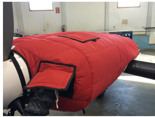
Cessna 402 Insulated Engine Cover with Heater