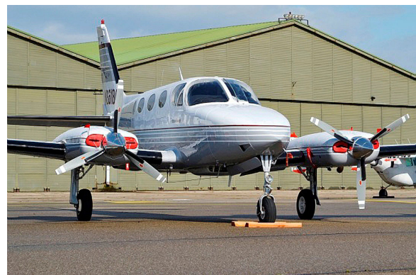
Cessna 340 Engine Plugs