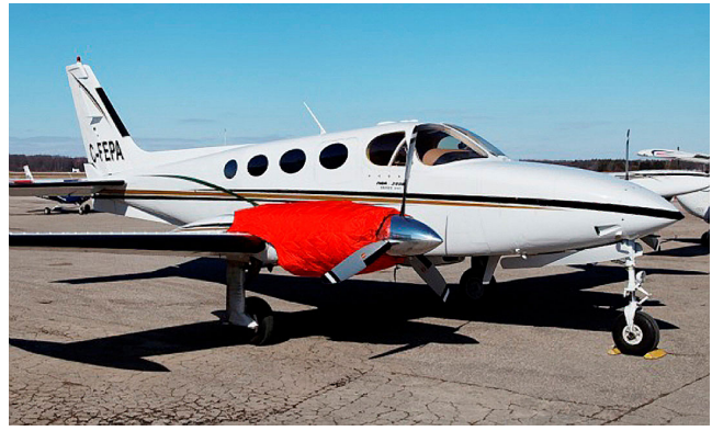
Cessna 340 Insulated Engine Covers