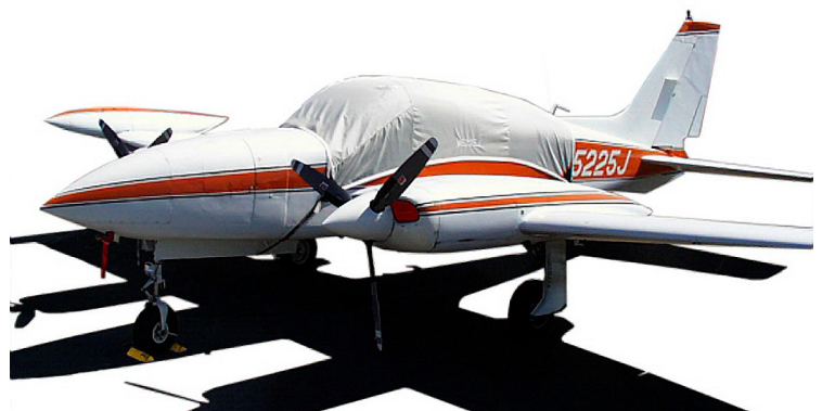
Cessna 310Q Canopy Cover