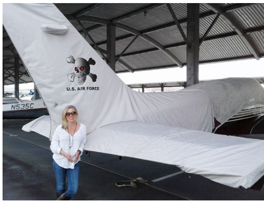
Cessna 310R Empennage Cover