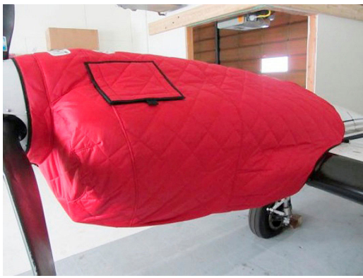
Cessna 421 Insulated Engine Covers