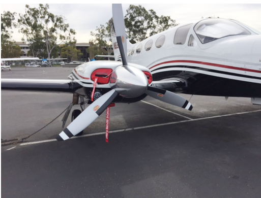
Cessna 414 Engine Inlet Plugs

Engine Inlet Plugs are custom fit for your Cessna 320 intakes, made with heavy-duty vinyl material, and stuffed with a single block of sculpted urethane foam. Each plug has a zipper that allows the foam to be removed and dried if necessary. Engine plugs have warning flags that are visible from the cockpit or 'remove before flight' streamers sewn onto the face of the plugs. Most plugs are imprinted with the aircraft registration number in black for an extra charge. Storage bag NOT included. Engine plugs may be inserted after flight when the engine is still warm. Engine Inlet Plugs are commonly referred to as Cowl Plugs, Intake Plugs, Cowl Blocks, Engine Blocks, and Engine Bungs.