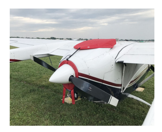
Cessna 337 Skymaster Aft Engine Inlet Cover, Rear Engine Plugs (SOLD SEPARATELY)

Engine Inlet Plugs are custom fit for your Cessna 336 (Fixed Gear Skymaster) intakes, made with heavy-duty vinyl material, and stuffed with a single block of sculpted urethane foam. Each plug has a zipper that allows the foam to be removed and dried if necessary. Engine plugs have warning flags that are visible from the cockpit or 'remove before flight' streamers sewn onto the face of the plugs. Most plugs are imprinted with the aircraft registration number in black for an extra charge. Storage bag NOT included. Engine plugs may be inserted after flight when the engine is still warm. Engine Inlet Plugs are commonly referred to as Cowl Plugs, Intake Plugs, Cowl Blocks, Engine Blocks, and Engine Bungs.