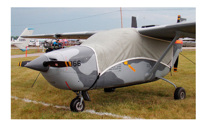
Cessna 337 Skymaster Canopy Cover w/ 14" bib ext.

This cover type is made from Silver Acrylic Sunbrella canvas and is 100% lined with a soft and smooth microfiber. Bruce's Custom Covers developed this material combination especially for aircraft protection. The outer material is medium weight and treated for water resistance, UV resistance and anti-static buildup. The inner lining is a very soft and smooth microfiber to prevent scratching. The material is very reflective, and tests show that the cabin interior temperature can be reduced to near-ambient temperature on the hottest of days. It is water, ice and snow repellent, yet breathable to allow moisture to escape from between the cover and the aircraft surface.