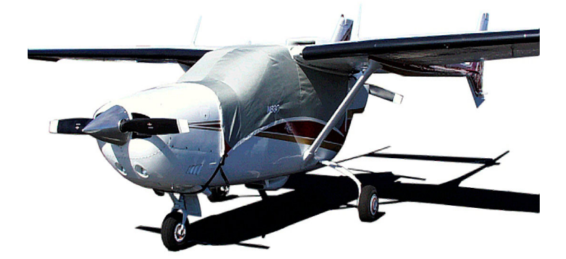
Cessna Skymaster Canopy Cover with Forward Extension, Fwd. Engine Plugs, Aft Engine Cover