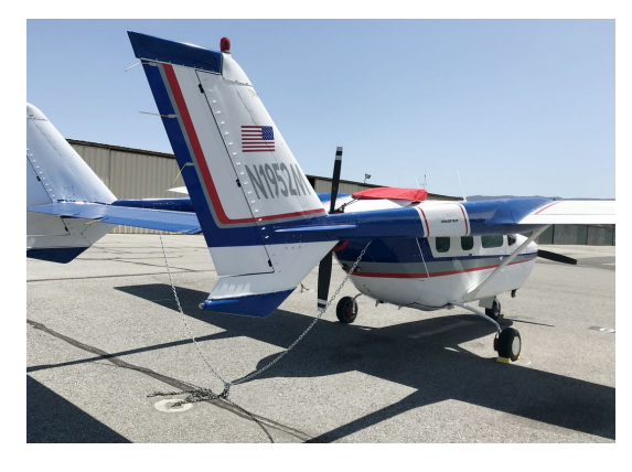
Cessna Skymaster 337G Rear Engine Inlet Cover