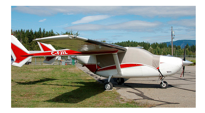
Cessna 337 Skymaster Canopy Cover w/ 14" bib ext.