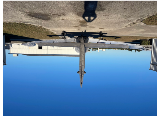
Cessna 340 Empennage Cover, Wing/Engine Covers