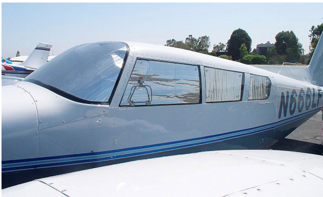
Piper PA-30 Twin Comanche Cockpit HeatShields

Cockpit Heatshields are interior sunshades for the aircraft's cockpit. The product is a unique composite of closed-cell foam with a silver mylar finish. The semi-rigid design is stiff enough to stand inside the window framing. The set folds up flat and is easily stored in the included storage sleeve. Some designs may require velcro and suction cups. A Heatshield is an excellent short-term remedy for cockpit overheating, but an external fabric cover is more effective for long-term protection.