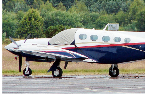
Cessna 421 Cockpit Cover