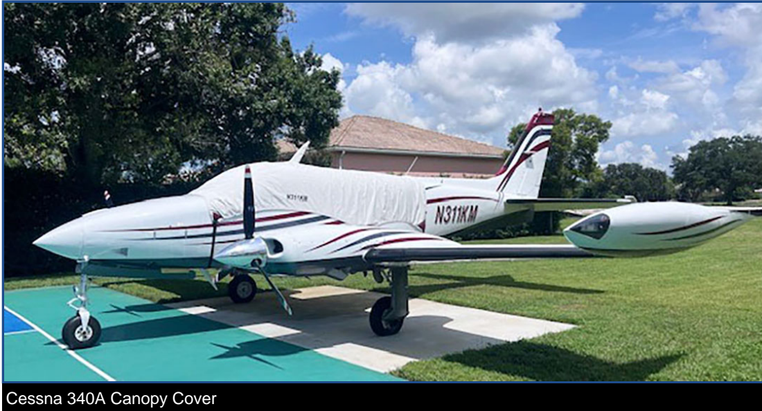
Cessna 340A Canopy Cover