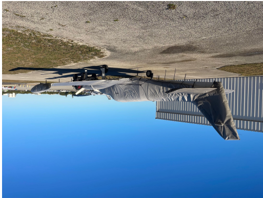
Cessna 340 Empennage Cover, Wing/Engine Covers

WINTER USE MATERIAL - Made with Solution-Dyed Polyester fabric, this option is intended for seasonal use to aid in deicing, rain mitigation, or for occasional travel. The material is lighter and more compact, but more susceptible to UV damage and may have a shorter useful life if used continuously outside than the all-year use material.