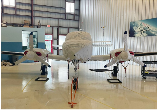
Cessna 340 Extended Canopy/Nose Cover

This cover type is made from Silver Acrylic Sunbrella canvas and is 100% lined with a soft and smooth microfiber. Bruce's Custom Covers developed this material combination especially for aircraft protection. The outer material is medium weight and treated for water resistance, UV resistance and anti-static buildup. The inner lining is a very soft and smooth microfiber to prevent scratching. The material is very reflective, and tests show that the cabin interior temperature can be reduced to near-ambient temperature on the hottest of days. It is water, ice and snow repellent, yet breathable to allow moisture to escape from between the cover and the aircraft surface.