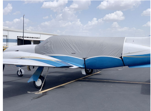
Cessna 414 Travel Weight Canopy Cover