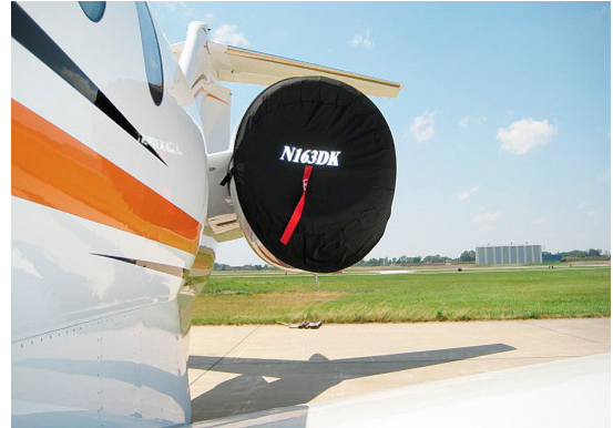
Hawker 4000 Intake Cover