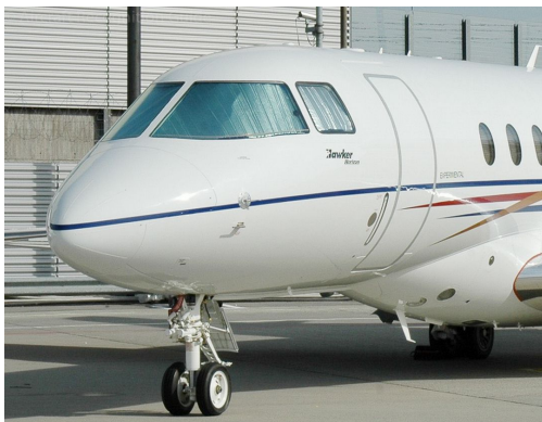
Hawker Beechcraft 4000 Horizon Cockpit Heatshields

Cockpit Heatshields are interior sunshades for the aircraft's cockpit. The product is a unique composite of closed-cell foam with a silver mylar finish. The semi-rigid design is stiff enough to stand inside the window framing. The set folds up flat and is easily stored in the included storage sleeve. Some designs may require velcro and suction cups. Our Heatshields for jets are offered white side out because some aircraft manufacturers have issued advisories against reflective window inserts due to potential heat damage. A Heatshield is an excellent short-term remedy for cockpit overheating, but an external fabric cover is more effective for long-term protection.