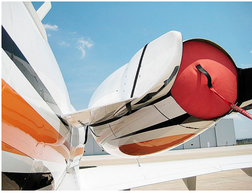
Hawker 4000 Exhaust Plug