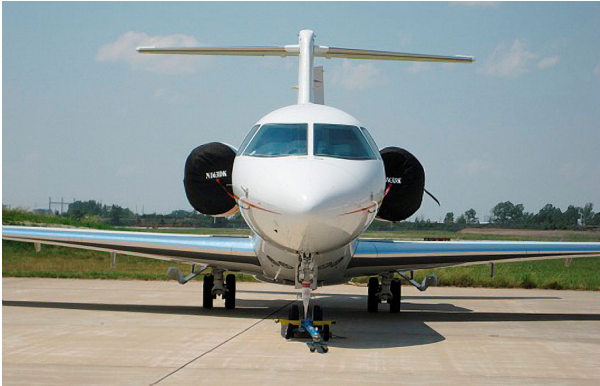
Hawker 4000 Intake Covers

The Hawker Beechcraft 4000 Horizon Intake Covers are designed to install easily yet be completely storable. A spring steel hoop is sewn into the hem of each cover, allowing them to be installed without climbing onto the wing or using a stepladder. To store the covers the spring steel hoop folds like a band-saw blade into three nesting rings. Each cover folds into a compact circular bundle which is stored in the included duffle bag, yet they unfold quickly for use. The Tri-Fold Ring cover is made of medium weight nylon which is available in a variety of colors to match the paint trim. Each cover set comes complete with installation and folding instructions. The aircraft's registration number can be silkscreened onto the cover for an extra charge.