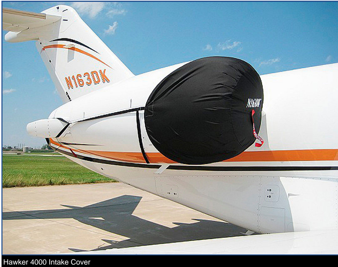
Hawker 4000 Intake Cover