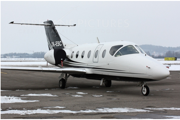
Nextant 400XTi Bikini Type Engine Covers