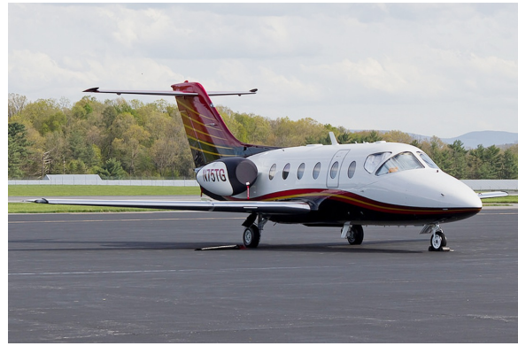
Nextant 400XTi Cockpit HeatShields, Bikini Type Engine Covers