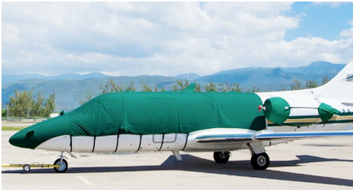
Raytheon Beechjet 400 Fuselage/Nose Cover, Engine Covers

This cover type is made from Silver Acrylic Sunbrella canvas and is 100% lined with a soft and smooth microfiber. Bruce's Custom Covers developed this material combination especially for aircraft protection. The outer material is medium weight and treated for water resistance, UV resistance and anti-static buildup. The inner lining is a very soft and smooth microfiber to prevent scratching. The material is very reflective, and tests show that the cabin interior temperature can be reduced to near-ambient temperature on the hottest of days. It is water, ice and snow repellent, yet breathable to allow moisture to escape from between the cover and the aircraft surface.