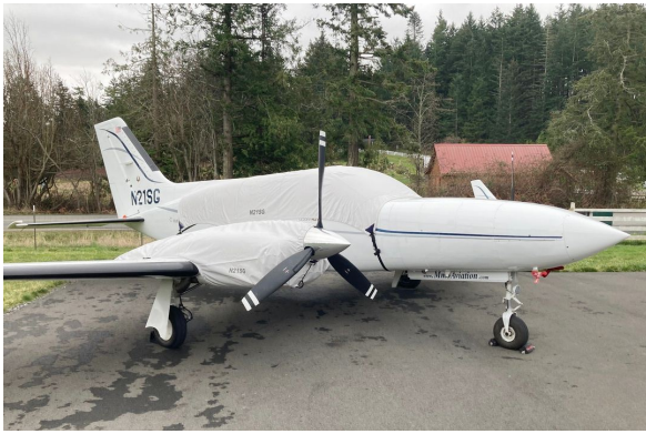
Cessna 421C Canopy & Engine Covers