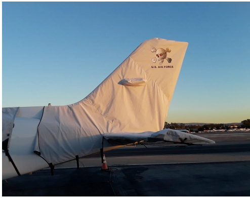
Cessna 421 Empennage Cover