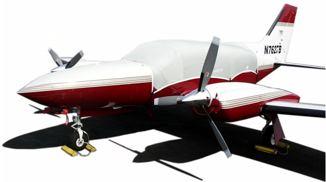
Cessna 421C Canopy Cover & Engine Plugs