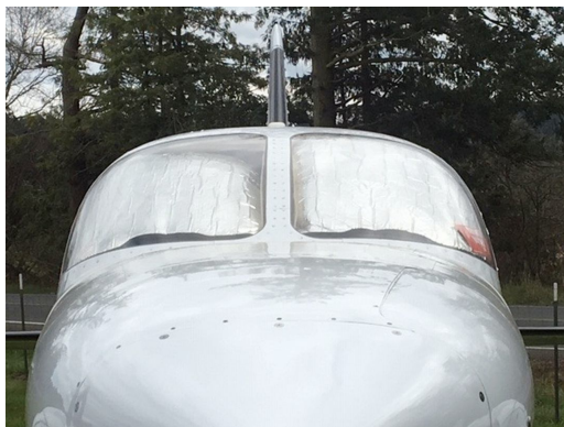
Cessna 421 Windshield HeatShields