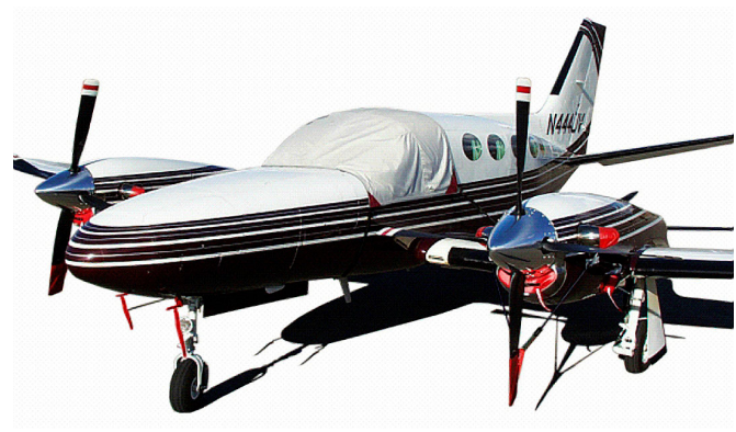
Cessna 425 Cockpit Cover