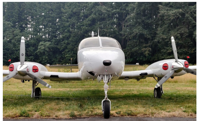
Cessna 340 Engine Plugs