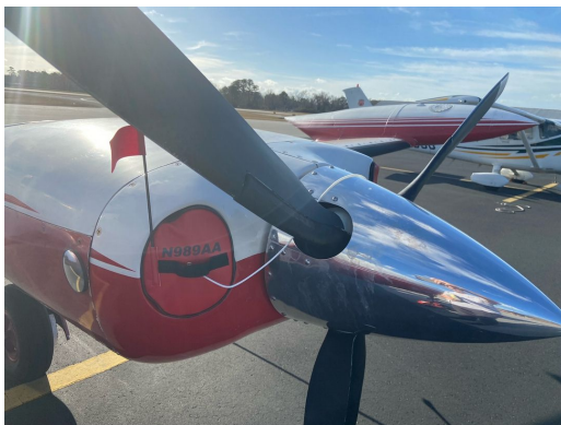
Cessna 401A Engine Inlet Plugs

Engine Inlet Plugs are custom fit for your Cessna 401 intakes, made with heavy-duty vinyl material, and stuffed with a single block of sculpted urethane foam. Each plug has a zipper that allows the foam to be removed and dried if necessary. Engine plugs have warning flags that are visible from the cockpit or 'remove before flight' streamers sewn onto the face of the plugs. Most plugs are imprinted with the aircraft registration number in black for an extra charge. Storage bag NOT included. Engine plugs may be inserted after flight when the engine is still warm. Engine Inlet Plugs are commonly referred to as Cowl Plugs, Intake Plugs, Cowl Blocks, Engine Blocks, and Engine Bungs.