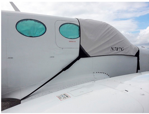
Cessna 340 Cockpit/Windshield Cover