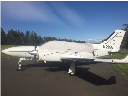
Cessna 421C Canopy Cover