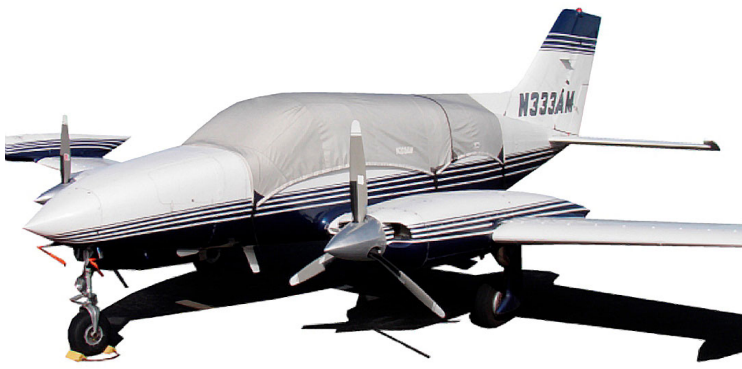
Cessna 414 Canopy Cover & Pitot Covers