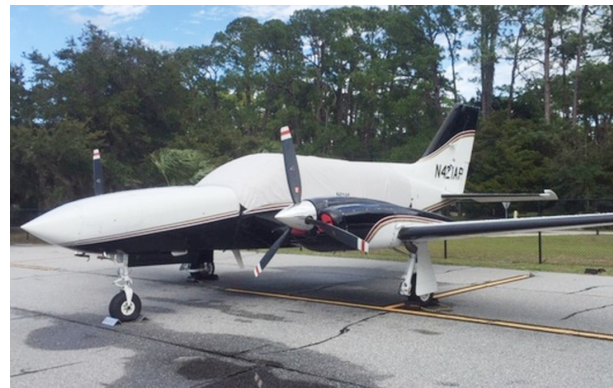
Cessna 421 Canopy Cover, Engine Plugs