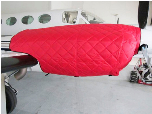
Cessna 421 Insulated Engine Covers