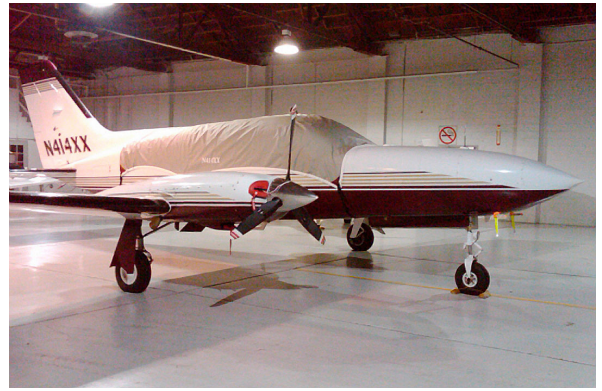
Cessna 414 Canopy Cover and Engine Inlet Plugs