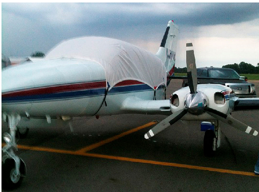
Cessna 401B Canopy Cover

The Cessna 402 Nose Cover is designed to cover the section of the fuselage forward of the windshield to the tip of the nose. It is secured with belly straps. This cover type is made from Silver Acrylic Sunbrella canvas and is 100% lined with a soft and smooth microfiber. Bruce's Custom Covers developed this material combination especially for aircraft protection. The outer material is medium weight and treated for water resistance, UV resistance and anti-static buildup. The inner lining is a very soft and smooth microfiber to prevent scratching. The material is very reflective, and tests show that the cabin interior temperature can be reduced to near-ambient temperature on the hottest of days. It is water, ice and snow repellent, yet breathable to allow moisture to escape from between the cover and the aircraft surface.