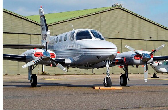
Cessna 340 Engine Plugs