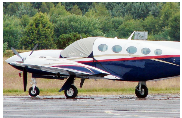
Cessna 421 Cockpit Cover