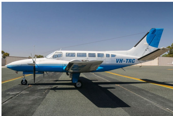
Cessna 404 & F406 HeatShields