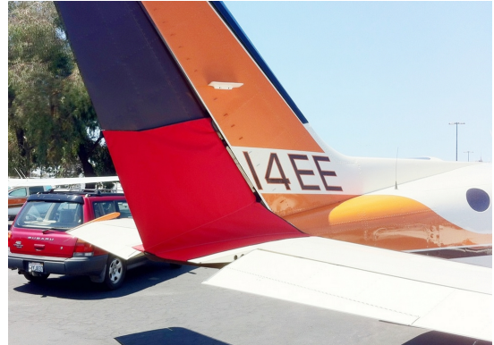
Cessna 414 Rudder Openings Cover (bird barrier)