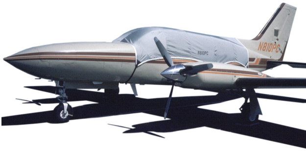
Cessna 421 Cockpit/Windshield Cover

non-travel Sunbrella Cover is the best choice.