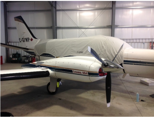
Cessna 404 Canopy Cover, Engine Plugs

This cover type is made from Silver Acrylic Sunbrella canvas and is 100% lined with a soft and smooth microfiber. Bruce's Custom Covers developed this material combination especially for aircraft protection. The outer material is medium weight and treated for water resistance, UV resistance and anti-static buildup. The inner lining is a very soft and smooth microfiber to prevent scratching. The material is very reflective, and tests show that the cabin interior temperature can be reduced to near-ambient temperature on the hottest of days. It is water, ice and snow repellent, yet breathable to allow moisture to escape from between the cover and the aircraft surface.