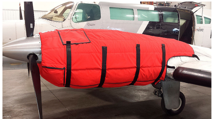
Cessna 404 Insulated Engine Cover