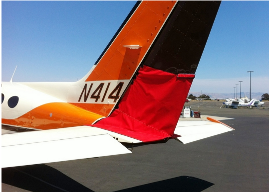
Cessna 414 Rudder Openings Cover (bird barrier)

WINTER USE MATERIAL - Made with Solution-Dyed Polyester fabric, this option is intended for seasonal use to aid in deicing, rain mitigation, or for occasional travel. The material is lighter and more compact, but more susceptible to UV damage and may have a shorter useful life if used continuously outside than the all-year use material.