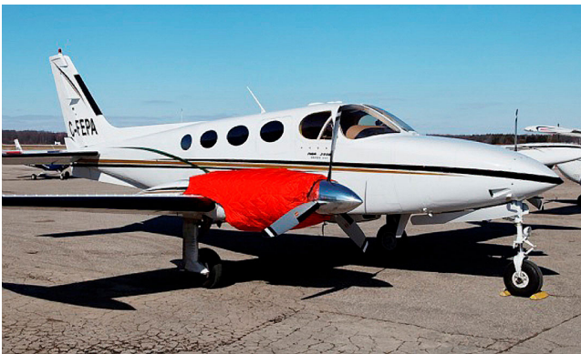
Cessna 340 Insulated Engine Covers

This cover type is made from Silver Acrylic Sunbrella canvas and is 100% lined with a soft and smooth microfiber. Bruce's Custom Covers developed this material combination especially for aircraft protection. The outer material is medium weight and treated for water resistance, UV resistance and anti-static buildup. The inner lining is a very soft and smooth microfiber to prevent scratching. The material is very reflective, and tests show that the cabin interior temperature can be reduced to near-ambient temperature on the hottest of days. It is water, ice and snow repellent, yet breathable to allow moisture to escape from between the cover and the aircraft surface.