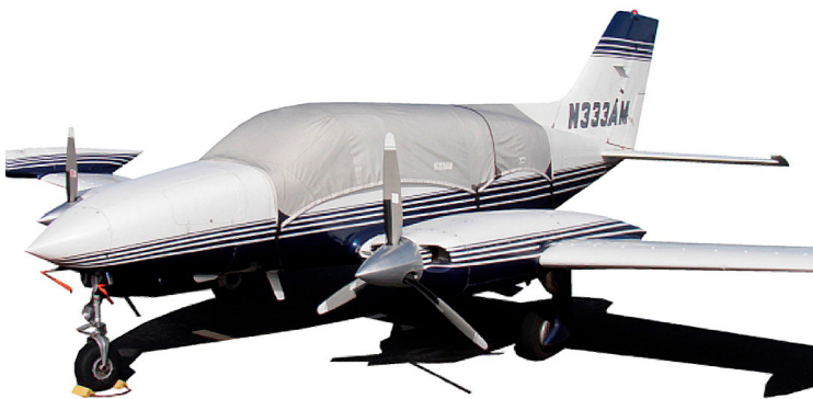
Cessna 414 Canopy Cover & Pitot Covers

This cover type is made from Silver Acrylic Sunbrella canvas and is 100% lined with a soft and smooth microfiber. Bruce's Custom Covers developed this material combination especially for aircraft protection. The outer material is medium weight and treated for water resistance, UV resistance and anti-static buildup. The inner lining is a very soft and smooth microfiber to prevent scratching. The material is very reflective, and tests show that the cabin interior temperature can be reduced to near-ambient temperature on the hottest of days. It is water, ice and snow repellent, yet breathable to allow moisture to escape from between the cover and the aircraft surface.