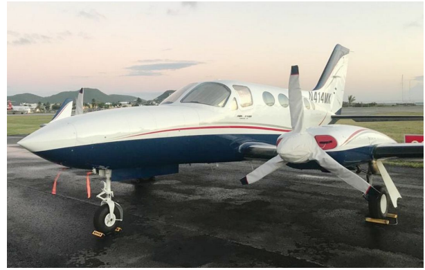
Cessna 414 Propellor/Spinner Covers, 3 Blade