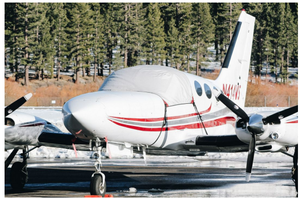
Cessna 414 Cockpit Cover