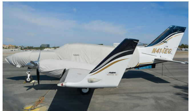
Cessna 414A Extended Canopy/Nose Cover & Engine Covers