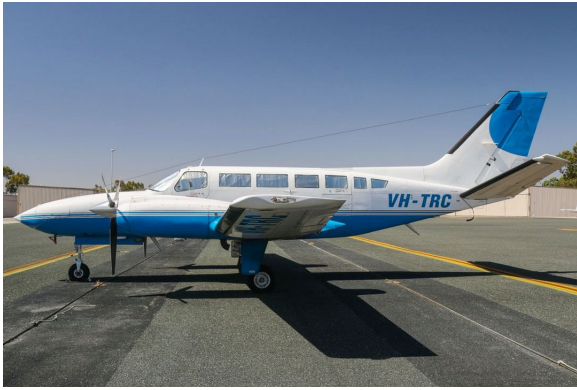
Cessna 404 & F406 HeatShields

window framing. It folds up flat and easily stores in the included storage sleeve. Some designs may require velcro and suction cups. A Heatshield is an excellent short-term remedy for cockpit overheating.