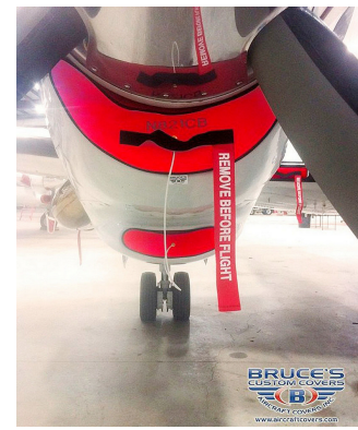
Engine and Oil Cooler Inlet Plugs