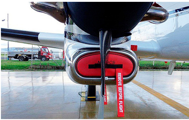
Beech King Air C90B Main Engine Inlet Plug