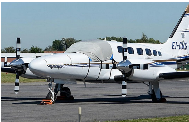
Cessna 441 Cockpit Cover