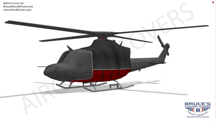
Bell 412 Forward Cabin/Nose, Insulated Engine, Tailboom, Rotor Hub & Blade Covers