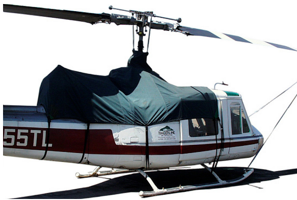
Bell 204/205 Engine/Mid-Cabin Cover

WINTER USE MATERIAL - Made with Solution-Dyed Polyester fabric, this option is intended for seasonal use to aid in deicing, rain mitigation, or for occasional travel. The material is lighter and more compact, but more susceptible to UV damage and may have a shorter useful life if used continuously outside than the all-year use material.