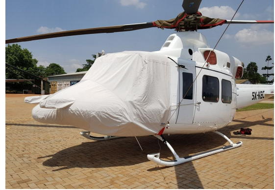
Bell 412 Cockpit/Canopy/Nose Cover