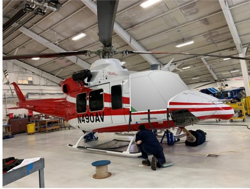
Bell 412 Cockpit/Canopy Cover, photo/illustration

Canopy/Nose Covers enclose the entire canopy including the windshield, skylights, and chin bubble. Attachment buckles are made of nonmetal Delrin , designed for rugged outdoor use. Both the top and bottom hems of the cover have a special rope-hem feature with which they can be tightened to help prevent abrasive chafing of the windshield. Pockets are sewn into the cover for the temperature probe and pitot tubes. The bubble cover is reinforced with patches at hinge points, door handles, and for the windshield wipers. For ease of installation, the bubble cover is color-coded (red=left, green=right) with color swatches sewn into the corners. This cover type is made from Silver Acrylic Sunbrella canvas and is 100% lined with a soft and smooth microfiber. Bruce's Custom Covers developed this material combination especially for aircraft protection. The outer material is medium weight and treated for water resistance, UV resistance and anti-static buildup. The inner lining is a very soft and smooth microfiber to prevent scratching. The material is very reflective, and tests show that the cabin interior temperature can be reduced to near-ambient temperature on the hottest of days. It is water, ice and snow repellent, yet breathable to allow moisture to escape from between the cover and the aircraft surface.