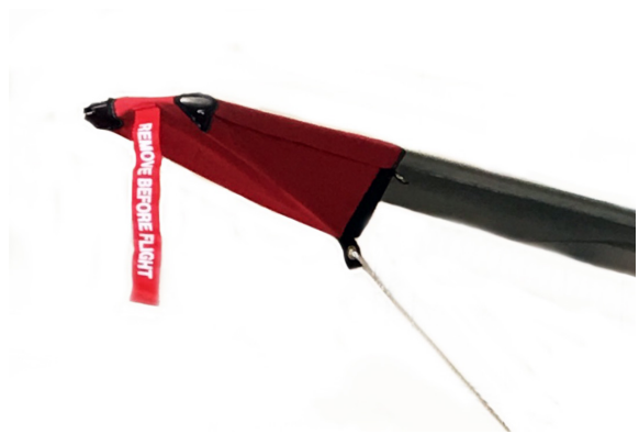
BLADE TIE DOWNS