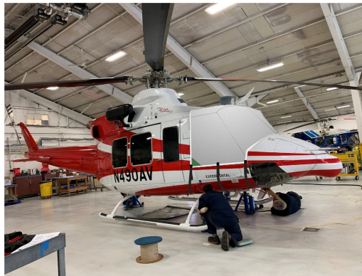
Bell 412 Cockpit/Canopy Cover, photo/illustration

Travel Covers are made with Silver Solution-Dyed Polyester fabric and fully lined over the entire cover. The material is lightweight and more compact for easy stowage in the aircraft. The polyester material is water resistant, but only intended for occasional use outside. We also have an ultra lightweight material available for fitted hangar dust covers. For daily outdoor use, the non-travel Sunbrella Cover is the best choice.