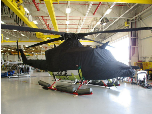
Bell 412 Cockpit/Canopy/Nose, Insulated Engine Area, Rotor Hub, Blade, Tailboom and Tail Rotor Covers

The Tailboom Cover details vary by model, but generally the helicopter tail boom cover encloses the tail boom from the "bottleneck" to the aft end. They usually also cover the horizontal stabilizers, and are custom made to allow for antennae, lights, and other protrusions. They attach with straps underneath the tail boom. Covers for the vertical and horizontal stabilizers are also available separately. Specific information for each model is available on request.