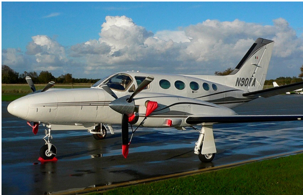
Cessna 425 Engine Plugs, Prop Tie/Exhaust Covers

single block of sculpted urethane foam. Each plug has a zipper that allows the foam to be removed and dried if necessary. Engine plugs have warning flags that are visible from the cockpit or 'remove before flight' streamers sewn onto the face of the plugs. Most plugs are imprinted with the aircraft registration number in black for an extra charge. Storage bag NOT included. Engine plugs may be inserted after flight when the engine is still warm. Engine Inlet Plugs are commonly referred to as Cowl Plugs, Intake Plugs, Cowl Blocks, Engine Blocks, and Engine Bungs.