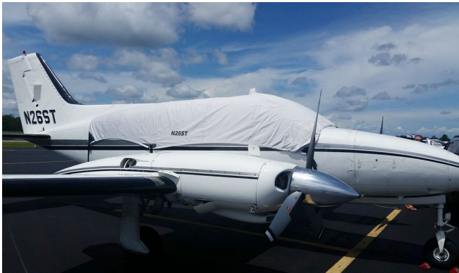
Cessna 414 Canopy Cover