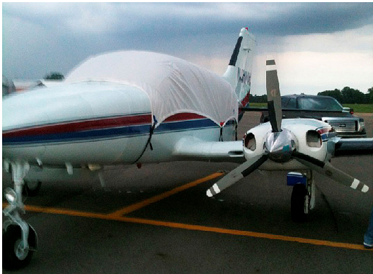
Cessna 401B Canopy Cover

Covers developed this material combination especially for aircraft protection. The outer material is medium weight and treated for water resistance, UV resistance and anti-static buildup. The inner lining is a very soft and smooth microfiber to prevent scratching. The material is very reflective, and tests show that the cabin interior temperature can be reduced to near-ambient temperature on the hottest of days. It is water, ice and snow repellent, yet breathable to allow moisture to escape from between the cover and the aircraft surface.