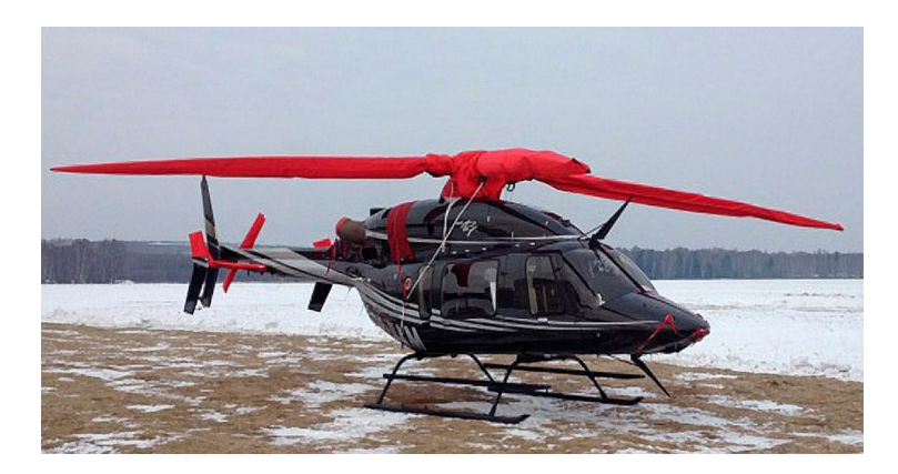
Bell 427 Rotor Blades, Main Rotor Hub/Drive Shafts, Horiz. Stabs, Tail Rotor Covers