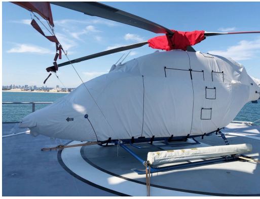
Bell 429 Main Body Cover