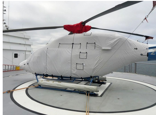
Bell 429 Main Body Cover, Rotor Hub & Tail Rotor Covers