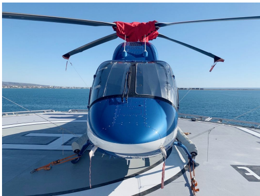
Bell 429 Windshield HeatShields, Rotor Mast Cover

Cockpit Heatshields are interior sunshades for the aircraft's cockpit. The product is a unique composite of closed-cell foam with a silver mylar finish. The semi-rigid design is stiff enough to stand inside the window framing. Darts and folds are incorporated into the material so that it conforms to the complex shape of the helicopter windows. The set folds up flat and is easily stored in the included storage sleeve. Some designs may require velcro and suction cups. A Heatshield is an excellent short-term remedy for cockpit overheating, but an external fabric cover is more effective for long-term protection.