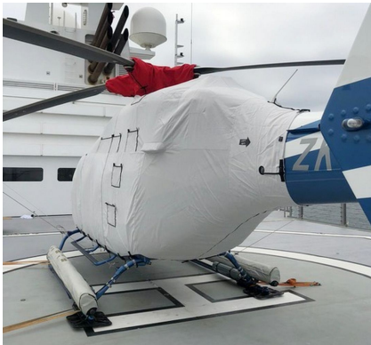
Bell 429 Main Body Cover, Rotor Hub & Tail Rotor Covers

WINTER USE MATERIAL - Made with Solution-Dyed Polyester fabric, this option is intended for seasonal use to aid in deicing, rain mitigation, or for occasional travel. The material is lighter and more compact, but more susceptible to UV damage and may have a shorter useful life if used continuously outside than the all-year use material.