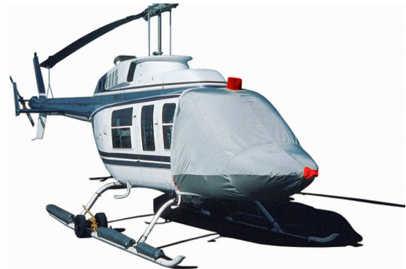
Cockpit Cover on Bell 206L