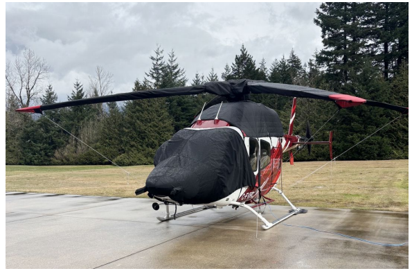
Bell 429 Cold Westher Cover Set