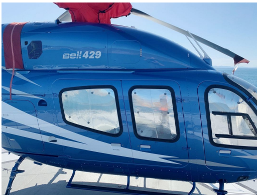
Bell 429 Cockpit & Cabin HeatShields

Cockpit Heatshields are interior sunshades for the aircraft's cockpit. The product is a unique composite of closed-cell foam with a silver mylar finish. The semi-rigid design is stiff enough to stand inside the window framing. Darts and folds are incorporated into the material so that it conforms to the complex shape of the helicopter windows. The set folds up flat and is easily stored in the included storage sleeve. Some designs may require velcro and suction cups. A Heatshield is an excellent short-term remedy for cockpit overheating, but an external fabric cover is more effective for long-term protection.