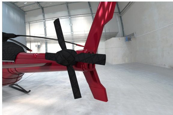
Bell 429 Tail Rotor Cover