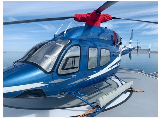
Bell 429 Rotor Hub Cover, Cockpit & Cabin HeatShields