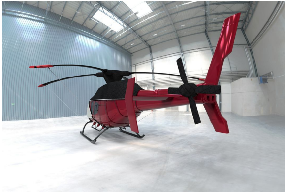
Bell 429 Tail Rotor, Engine, Rotor Hub Covers