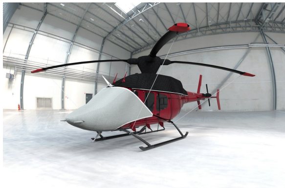
Bell 429 Cockpit/Nose Cover, Engine Cover, etc.

WINTER USE MATERIAL - Made with Solution-Dyed Polyester fabric, this option is intended for seasonal use to aid in deicing, rain mitigation, or for occasional travel. The material is lighter and more compact, but more susceptible to UV damage and may have a shorter useful life if used continuously outside than the all-year use material.