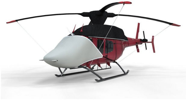
Bell 429 Cockpit/Nose Cover, Engine Cover, etc.