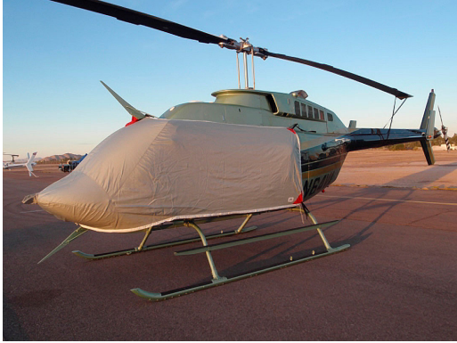
Bell 206L Longranger Bubble Cover

Travel Covers are made with Silver Solution-Dyed Polyester fabric and fully lined over the entire cover. The material is lightweight and more compact for easy stowage in the aircraft. The polyester material is water resistant, but only intended for occasional use outside. We also have an ultra lightweight material available for fitted hangar dust covers. For daily outdoor use, the non-travel Sunbrella Cover is the best choice.