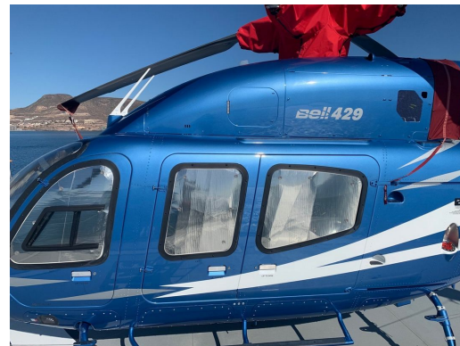
Bell 429 Cockpit & Cabin HeatShields, Rotor Mast/Drive Shafts Cover