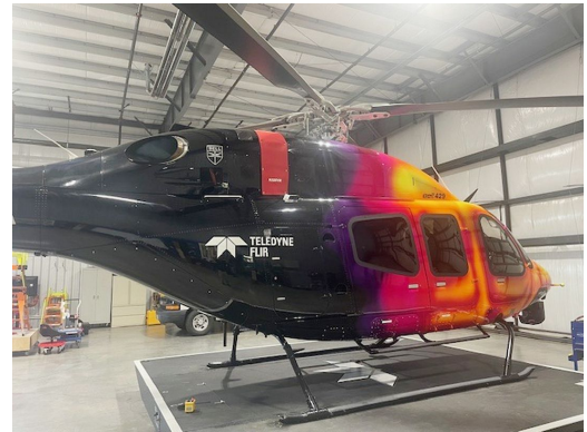
Bell 429 Inlet Barrier Filter Cover, Snap-On