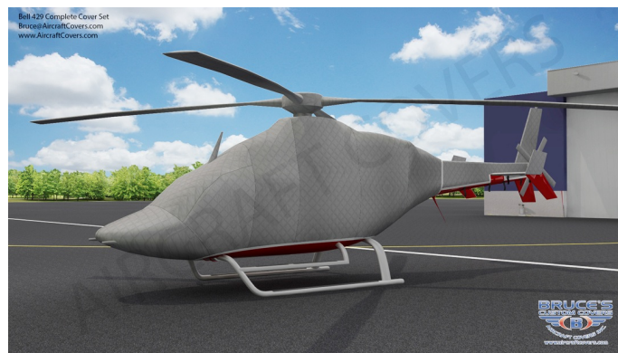
Bell 429 Full Cover Set (3D rendering)