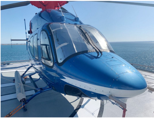
Bell 429 Cockpit HeatShields

Cockpit Heatshields are interior sunshades for the aircraft's cockpit. The product is a unique composite of closed-cell foam with a silver mylar finish. The semi-rigid design is stiff enough to stand inside the window framing. Darts and folds are incorporated into the material so that it conforms to the complex shape of the helicopter windows. The set folds up flat and is easily stored in the included storage sleeve. Some designs may require velcro and suction cups. A Heatshield is an excellent short-term remedy for cockpit overheating, but an external fabric cover is more effective for long-term protection.