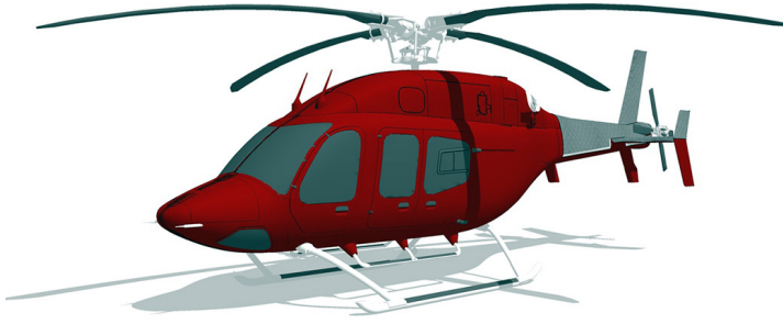
Bell 429 Insulated Tailboom Cover