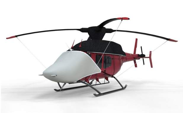
Bell 429 Cockpit/Nose Cover, Engine Cover, etc.

WINTER USE MATERIAL - Made with Solution-Dyed Polyester fabric, this option is intended for seasonal use to aid in deicing, rain mitigation, or for occasional travel. The material is lighter and more compact, but more susceptible to UV damage and may have a shorter useful life if used continuously outside than the all-year use material.