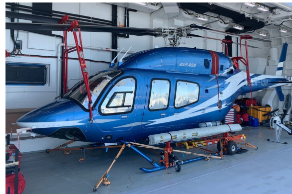
Bell 429 Cockpit & Cabin HeatShields