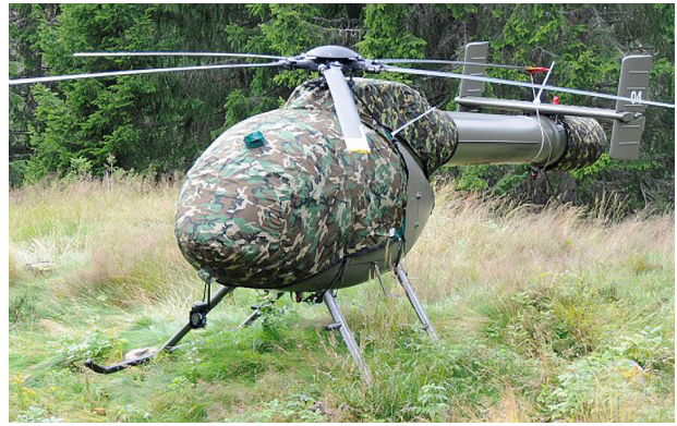
Hughes 500C (369HS) Bubble Cover, Blade Tie-Downs