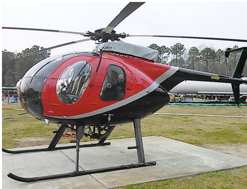
Customized Engine Cover

WINTER USE MATERIAL - Made with Solution-Dyed Polyester fabric, this option is intended for seasonal use to aid in deicing, rain mitigation, or for occasional travel. The material is lighter and more compact, but more susceptible to UV damage and may have a shorter useful life if used continuously outside than the all-year use material.