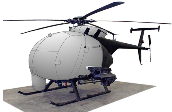
MH-6J Bubble, Flir & Doghouse Covers (illustration)