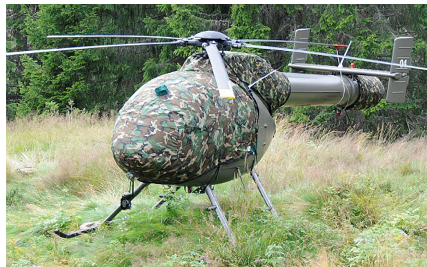
MD520 NOTAR Bubble, Engine, & NOTAR Covers & Blade Tie-downs