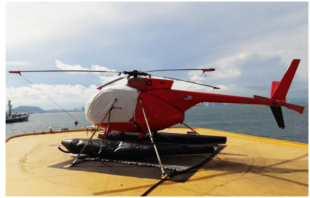
Hughes 500C (369HS) Bubble Cover, Blade Tie-Downs