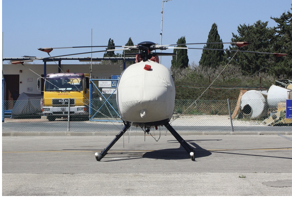
MD-500E Bubble Cover, Blade Tie-Diwns

WINTER USE MATERIAL - Made with Solution-Dyed Polyester fabric, this option is intended for seasonal use to aid in deicing, rain mitigation, or for occasional travel. The material is lighter and more compact, but more susceptible to UV damage and may have a shorter useful life if used continuously outside than the all-year use material.