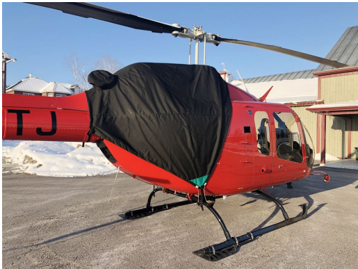
Bell 505 Engine Cover

WINTER USE MATERIAL - Made with Solution-Dyed Polyester fabric, this option is intended for seasonal use to aid in deicing, rain mitigation, or for occasional travel. The material is lighter and more compact, but more susceptible to UV damage and may have a shorter useful life if used continuously outside than the all-year use material.