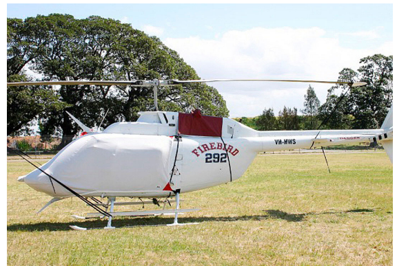
206B Bubble Cover