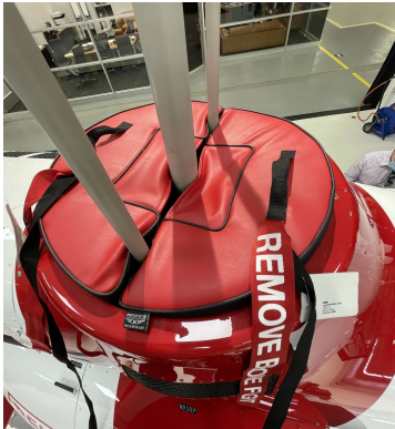
Bell 505 Swash Plate Plug

The Engine Inlet Plugs are custom fit for your Bell 505 Jet Ranger X intakes, made with heavy-duty vinyl material, and stuffed with a single block of sculpted urethane foam. Each plug has a zipper that allows the foam to be removed and dried if necessary. Engine plugs have 'Remove Before Flight' streamers sewn onto the face of the plugs. Most plugs are imprinted with the aircraft registration number in black for an extra charge. Storage bag NOT included. Engine plugs may be inserted after flight when the engine is still warm. Engine Inlet Plugs are commonly referred to as Cowl Plugs, Intake Plugs, Cowl Blocks, Engine Blocks, and Engine Bungs.