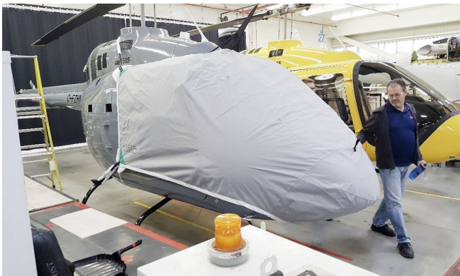
Bell 505 Bubble Cover

Travel Covers are made with Silver Solution-Dyed Polyester fabric and fully lined over the entire cover. The material is lightweight and more compact for easy storage in the aircraft. The polyester material is water resistant, but only intended for occasional use outside. We also have an ultra lightweight material available for fitted hangar dust covers. For daily outdoor use, the non-travel Sunbrella Cover is the best choice.