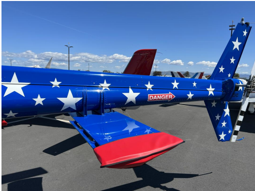
Bell 505 Horizontal Stabilizer Tip Pads