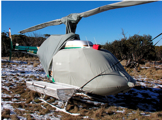
JetRanger Bubble, Engine, Rotor Hub & Blade Covers (& Tie-Downs)