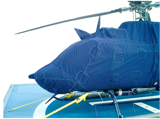
206B/206L/407 Full Body Cover