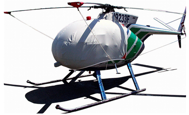
Hughes 500C Bubble Cover with Intake Add-on, Blade Tie-downs