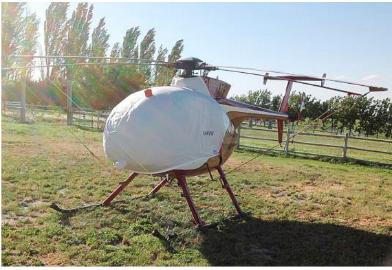
MD500D Bubble Cover with Intake Add-On