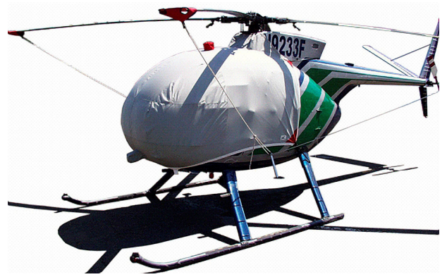
Hughes 500C Bubble Cover with Intake Add-on, Blade Tie-downs