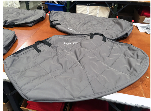
Protective Door Bags