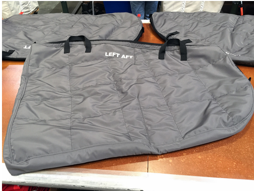
Protective Door Bags

**Padded Door Bags* are designed to provide portable protection of the doors when they are removed from the aircraft. They are padded to moderate thickness, zippered closed, and have sturdy carry handles for easy transport.