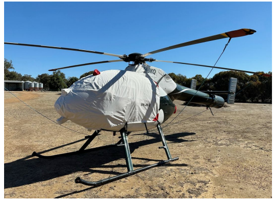
MDD 520 NOTAR Bubble Cover w/Intake Cover Add-On