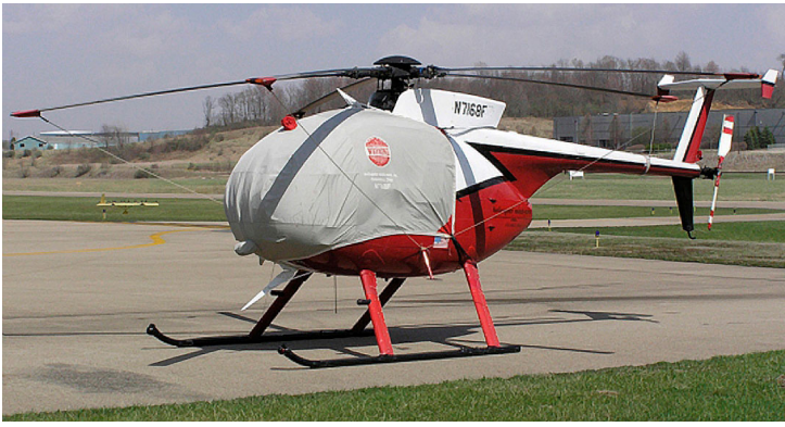
Hughes 500D Bubble Cover with Wire Strike detail and Blade Tie-downs