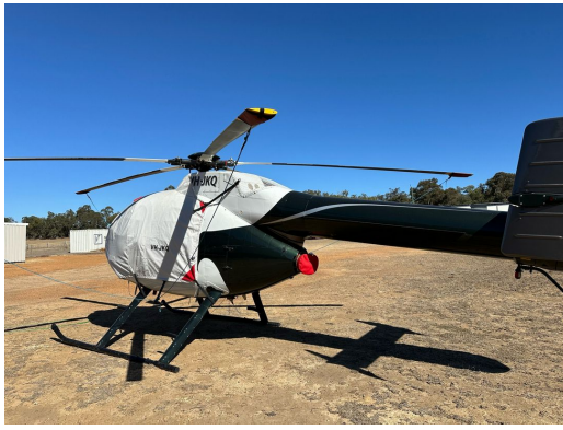
MDD 520 NOTAR Bubble Cover w/Intake Cover Add-On, Exhaust Cover