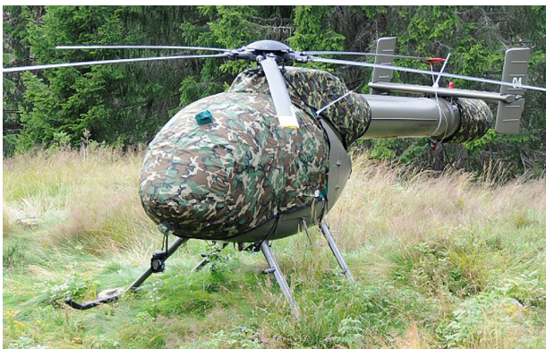
MD520 NOTAR Bubble, Engine, & NOTAR Covers & Blade Tie-downs

The Tailboom Cover details vary by model, but generally the helicopter tail boom cover encloses the tail boom from the "bottleneck" to the aft end. They usually also cover the horizontal stabilizers, and are custom made to allow for antennae, lights, and other protrusions. They attach with straps underneath the tail boom. Covers for the vertical and horizontal stabilizers are also available separately. Specific information for each model is available on request.