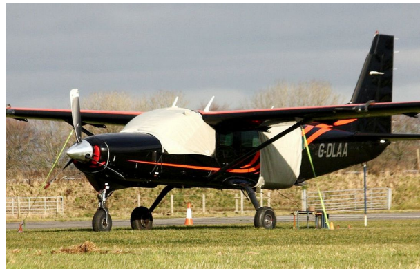
Cessna Caravan Cockpit Cover, Engine Plugs, Jump Door Cover