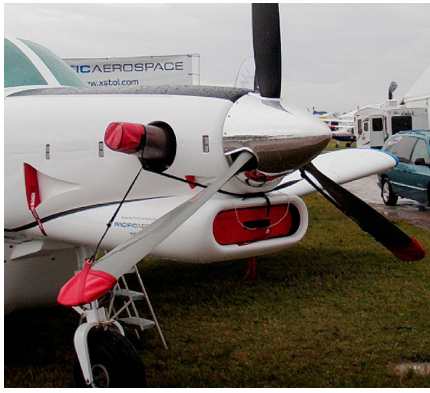
750XL Engine Inlet Plugs & Prop Tie/Exhaust Covers