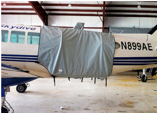
750XL Jump Door Cover