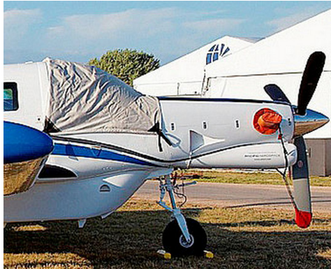
750XL Cockpit Cover & Prop Tie/Exhaust Covers

This cover type is made from Silver Acrylic Sunbrella canvas and is 100% lined with a soft and smooth microfiber. Bruce's Custom Covers developed this material combination especially for aircraft protection. The outer material is medium weight and treated for water resistance, UV resistance and anti-static buildup. The inner lining is a very soft and smooth microfiber to prevent scratching. The material is very reflective, and tests show that the cabin interior temperature can be reduced to near-ambient temperature on the hottest of days. It is water, ice and snow repellent, yet breathable to allow moisture to escape from between the cover and the aircraft surface.