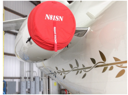
Falcon 900EX Intake Cover