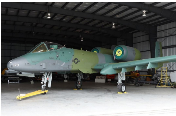
Fairchild A10 Intake Plugs, non-folding type

The Engine Inlet Plugs are custom fit for your Fairchild A10 Thunderbolt intakes, made with heavy-duty vinyl material, and stuffed with a single block of sculpted urethane foam. Each plug has a zipper that allows the foam to be removed and dried if necessary. Engine plugs have 'remove before flight' streamers sewn onto the face of the plugs. Most plugs are imprinted with the aircraft registration number in black for an extra charge. Storage bag NOT included. Engine plugs may be inserted after flight when the engine is still warm. Engine Inlet Plugs are commonly referred to as Cowl Plugs, Intake Plugs, Cowl Blocks, Engine Blocks, and Engine Bungs.