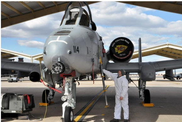
Fairchild A10 Intake Covers & Nose Gun Scoop Plug

The Engine Inlet Plugs are custom fit for your Fairchild A10 Thunderbolt intakes, made with heavy-duty vinyl material, and stuffed with a single block of sculpted urethane foam. Each plug has a zipper that allows the foam to be removed and dried if necessary. Engine plugs have 'remove before flight' streamers sewn onto the face of the plugs. Most plugs are imprinted with the aircraft registration number in black for an extra charge. Storage bag NOT included. Engine plugs may be inserted after flight when the engine is still warm. Engine Inlet Plugs are commonly referred to as Cowl Plugs, Intake Plugs, Cowl Blocks, Engine Blocks, and Engine Bungs.