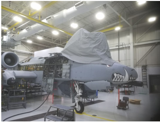
Fairchild A-10 Canopy Cover, open position