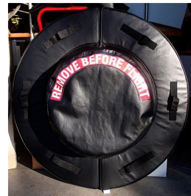
A-10 Exhaust Plug/Cover