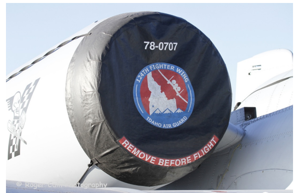
Fairchild A-10 Engine Covers