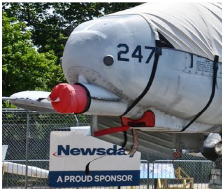
Fairchild A10 Thunderbolt Nose Gun Cover, Gun Scoop Inlet Plug

ALL-YEAR USE MATERIAL - Made with Silver Acrylic Sunbrella canvas, the all-year use material is the best option for sun protection and cover longevity. This heavier more durable material is intended for all weather conditions, such as rain and snow or lots of sun.