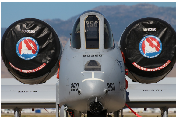
A-10 Engine Covers

ALL-YEAR USE MATERIAL - Made with Solution dyed Polyester fabric, the all-year use material is the best option for sun protection and cover longevity. This heavier more durable material is intended for all weather conditions, such as rain and snow or lots of sun.