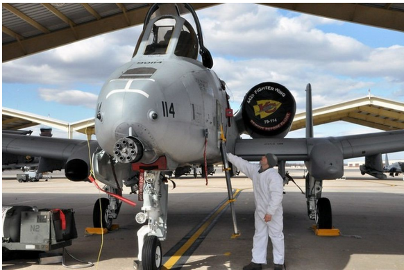
Fairchild A10 Intake Covers & Nose Gun Scoop Plug

The Engine Inlet Plugs are custom fit for your Fairchild A10 Thunderbolt intakes, made with heavy-duty vinyl material, and stuffed with a single block of sculpted urethane foam. Each plug has a zipper that allows the foam to be removed and dried if necessary. Engine plugs have 'remove before flight' streamers sewn onto the face of the plugs. Most plugs are imprinted with the aircraft registration number in black for an extra charge. Storage bag NOT included. Engine plugs may be inserted after flight when the engine is still warm. Engine Inlet Plugs are commonly referred to as Cowl Plugs, Intake Plugs, Cowl Blocks, Engine Blocks, and Engine Bungs.