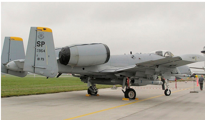
A-10 Engine Covers

ALL-YEAR USE MATERIAL - Made with Solution dyed Polyester fabric, the all-year use material is the best option for sun protection and cover longevity. This heavier more durable material is intended for all weather conditions, such as rain and snow or lots of sun.