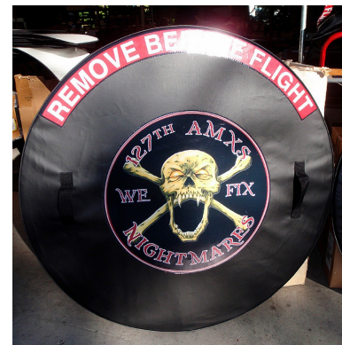
A-10 Engine Intake Plug