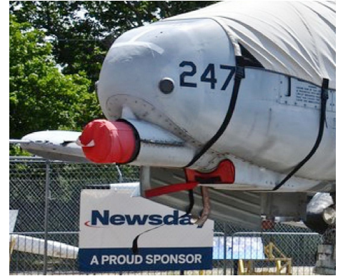
Fairchild A10 Thunderbolt Canopy Cover, Nose Gun Cover, Gun Scoop Inlet Plug Fairchild A10 Thunderbolt Nose Gun Cover, Gun Scoop Inlet Plug