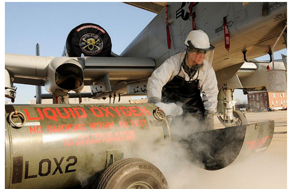
A-10 Engine Intake Cover