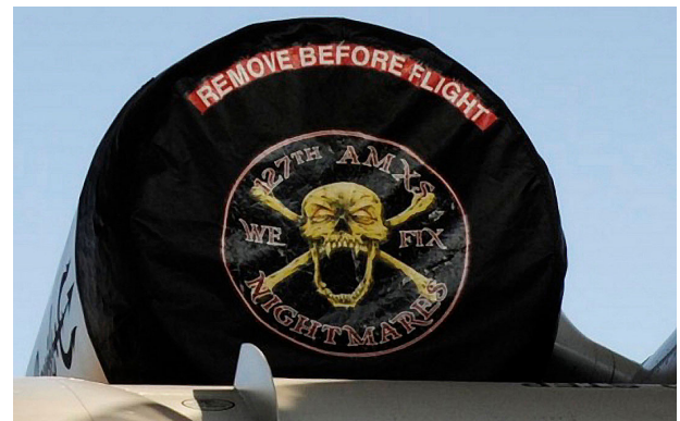
A-10 Engine Covers with Custom Artwork