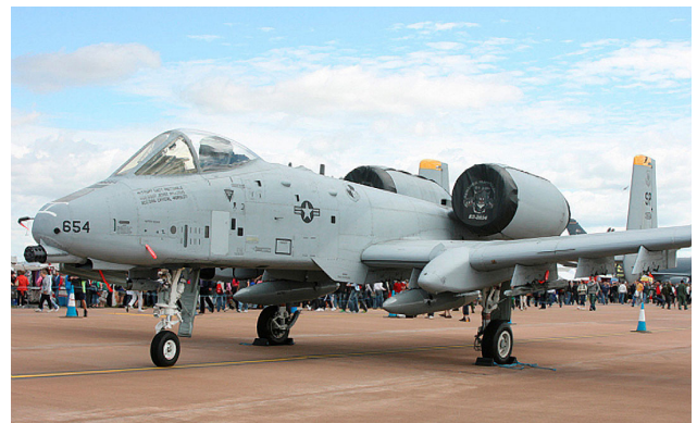
A-10 Engine Covers with Custom Artwork