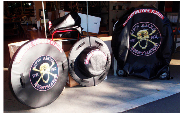
A-10 Engine Intake Plug, Exhaust Plug/Cover, Intake Cover (from left to right)