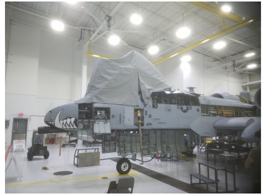
Fairchild A-10 Canopy Cover, open position