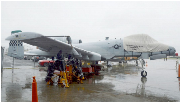
Fairchild A10 Thunderbolt Canopy Cover