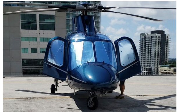
Agusta AW109 Power, A109E Heatshield Set