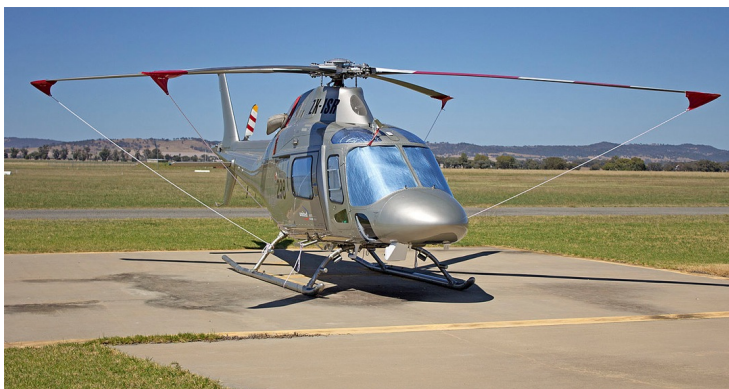
Agusta 119 Cockpit/Cabin HeatShields

Cockpit Heatshields are interior sunshades for the aircraft's cockpit. The product is a unique composite of closed-cell foam with a silver mylar finish. The semi-rigid design is stiff enough to stand inside the window framing. Darts and folds are incorporated into the material so that it conforms to the complex shape of the helicopter windows. The set folds up flat and is easily stored in the included storage sleeve. Some designs may require velcro and suction cups. A Heatshield is an excellent short-term remedy for cockpit overheating, but an external fabric cover is more effective for long-term protection.