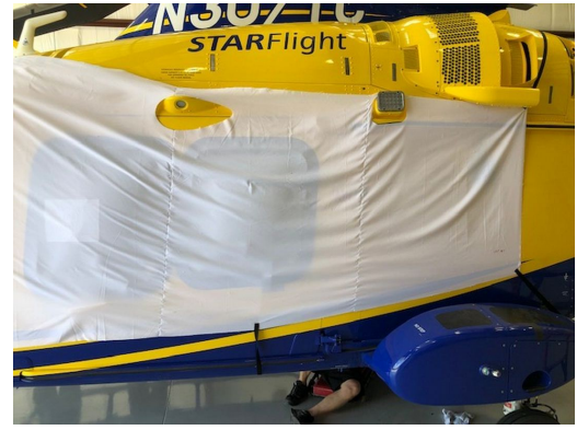
Leonardo (Agusta) A-169 Bubble Cover, test fit cover