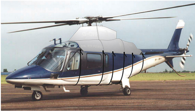
Agusta Power Engine Cover (illustration)

WINTER USE MATERIAL - Made with Solution-Dyed Polyester fabric, this option is intended for seasonal use to aid in deicing, rain mitigation, or for occasional travel. The material is lighter and more compact, but more susceptible to UV damage and may have a shorter useful life if used continuously outside than the all-year use material.