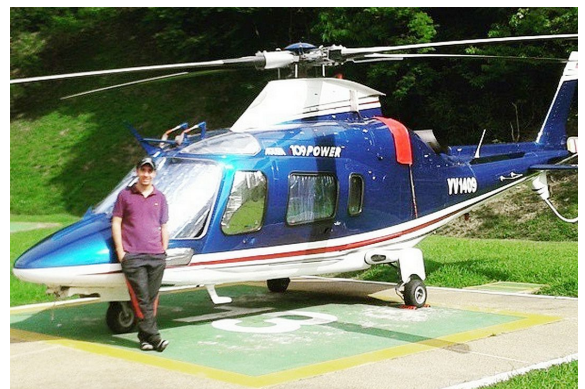
Agusta Power Cockpit & Cabin HeatShields