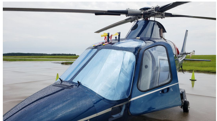
Agusta AW109S/SP Grand Heatshield Set