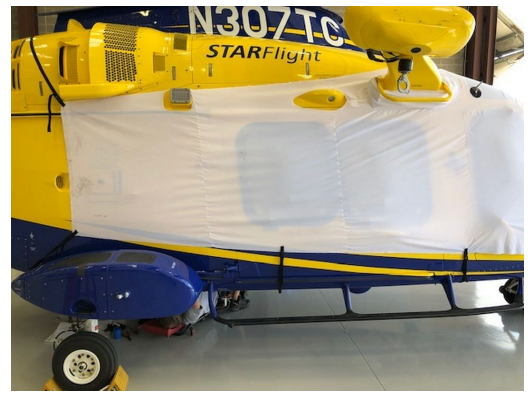
Leonardo (Agusta) A-169 Bubble Cover, test fit cover