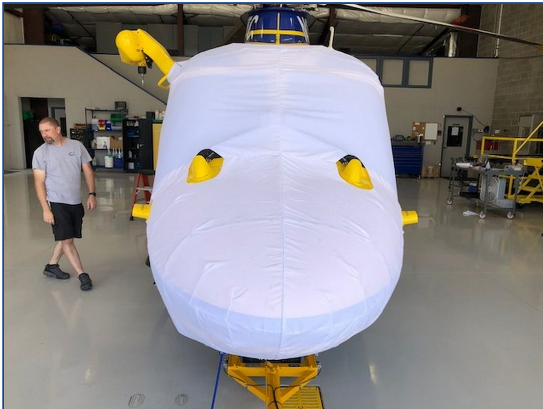
Leonardo (Agusta) A-169 Bubble Cover, test fit cover