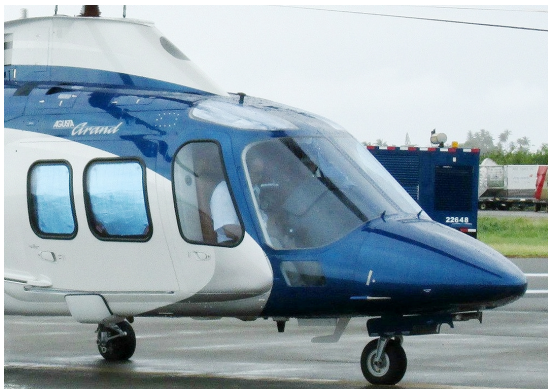
Agusta Grand Cabin & Skylight HeatShields

Cockpit Heatshields are interior sunshades for the aircraft's cockpit. The product is a unique composite of closed-cell foam with a silver mylar finish. The semi-rigid design is stiff enough to stand inside the window framing. Darts and folds are incorporated into the material so that it conforms to the complex shape of the helicopter windows. The set folds up flat and is easily stored in the included storage sleeve. Some designs may require velcro and suction cups. A Heatshield is an excellent short-term remedy for cockpit overheating, but an external fabric cover is more effective for long-term protection.