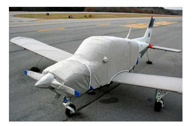
Beech Sierra Extended Canopy, Engine, Prop, Wings, Stab & Tailcone Covers

WINTER USE MATERIAL - Made with Solution-Dyed Polyester fabric, this option is intended for seasonal use to aid in deicing, rain mitigation, or for occasional travel. The material is lighter and more compact, but more susceptible to UV damage and may have a shorter useful life if used continuously outside than the all-year use material.