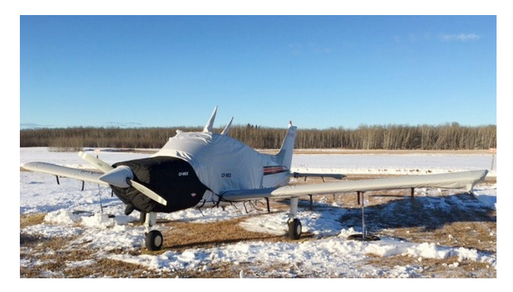
Beech Sport Insulated Engine Cover & Winter Cover Set

This cover type is made from Silver Acrylic Sunbrella canvas and is 100% lined with a soft and smooth microfiber. Bruce's Custom Covers developed this material combination especially for aircraft protection. The outer material is medium weight and treated for water resistance, UV resistance and anti-static buildup. The inner lining is a very soft and smooth microfiber to prevent scratching. The material is very reflective, and tests show that the cabin interior temperature can be reduced to near-ambient temperature on the hottest of days. It is water, ice and snow repellent, yet breathable to allow moisture to escape from between the cover and the aircraft surface.