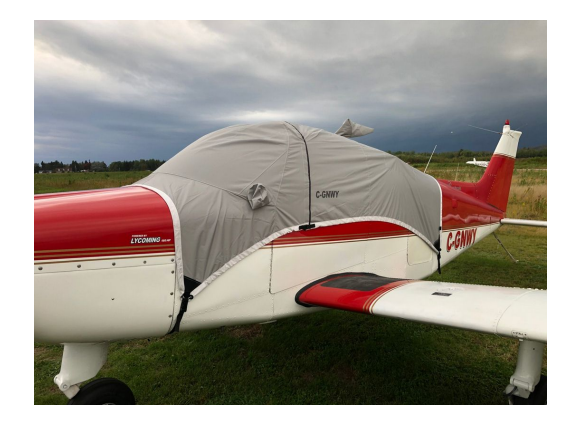
Beech Sundowner Travel Canopy Cover

Travel Covers are made with Silver Solution-Dyed Polyester fabric and only lined over the windshield to save weight. The material is lightweight and more compact for easy stowage in the aircraft. The polyester material is water resistant, but only intended for occasional use outside. We also have an ultra lightweight material available for fitted hangar dust covers. For daily outdoor use, the non-travel Sunbrella Cover is the best choice.