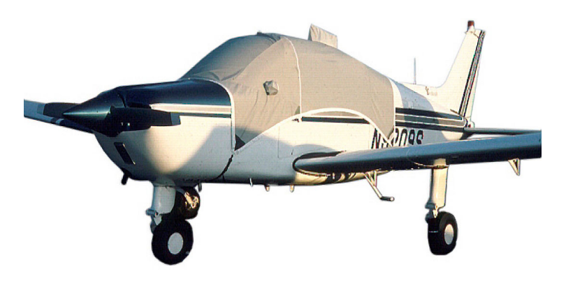
Beech Sport Canopy Cover