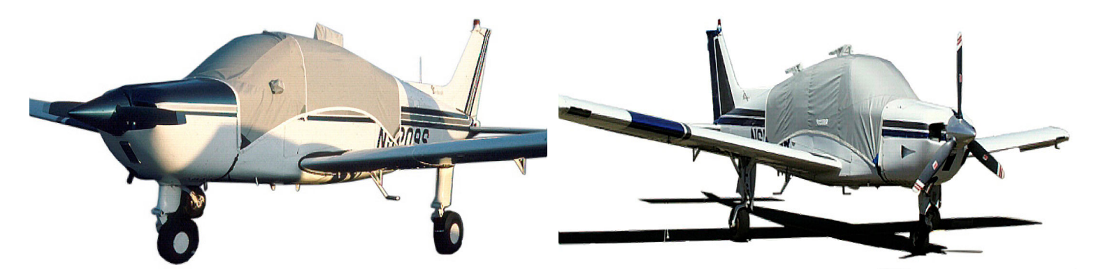
Beech Sport Canopy Cover

This cover type is made from Silver Acrylic Sunbrella canvas and is 100% lined with a soft and smooth microfiber. Bruce's Custom Covers developed this material combination especially for aircraft protection. The outer material is medium weight and treated for water resistance, UV resistance and anti-static buildup. The inner lining is a very soft and smooth microfiber to prevent scratching. The material is very reflective, and tests show that the cabin interior temperature can be reduced to near-ambient temperature on the hottest of days. It is water, ice and snow repellent, yet breathable to allow moisture to escape from between the cover and the aircraft surface.