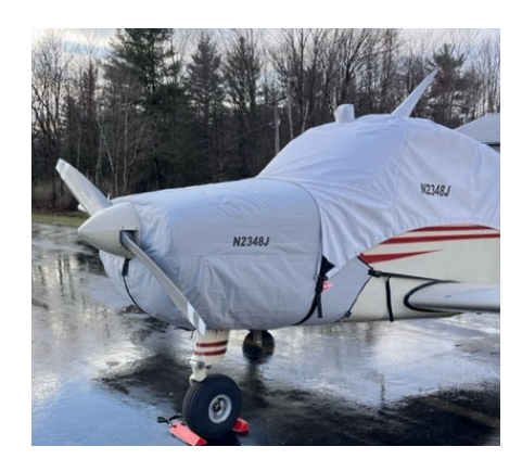
Beech Musketeer Insulated Engine Cover