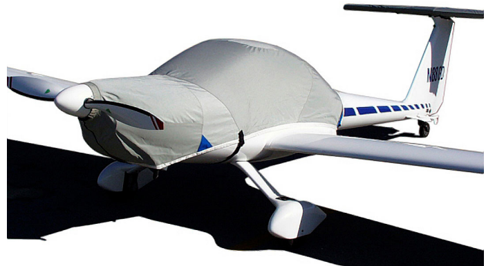
Diamond DA-20 Canopy/Engine Cover