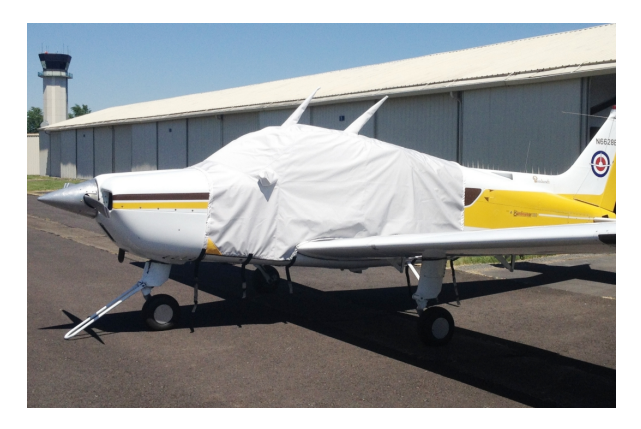
Beech Sundowner Extended Canopy Cover

This cover type is made from Silver Acrylic Sunbrella canvas and is 100% lined with a soft and smooth microfiber. Bruce's Custom Covers developed this material combination especially for aircraft protection. The outer material is medium weight and treated for water resistance, UV resistance and anti-static buildup. The inner lining is a very soft and smooth microfiber to prevent scratching. The material is very reflective, and tests show that the cabin interior temperature can be reduced to near-ambient temperature on the hottest of days. It is water, ice and snow repellent, yet breathable to allow moisture to escape from between the cover and the aircraft surface.