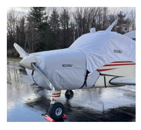
Beech Musketeer Insulated Engine Cover

This cover type is made from Silver Acrylic Sunbrella canvas and is 100% lined with a soft and smooth microfiber. Bruce's Custom Covers developed this material combination especially for aircraft protection. The outer material is medium weight and treated for water resistance, UV resistance and anti-static buildup. The inner lining is a very soft and smooth microfiber to prevent scratching. The material is very reflective, and tests show that the cabin interior temperature can be reduced to near-ambient temperature on the hottest of days. It is water, ice and snow repellent, yet breathable to allow moisture to escape from between the cover and the aircraft surface.