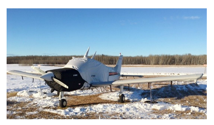
Beech Sport Insulated Engine Cover & Winter Cover Set