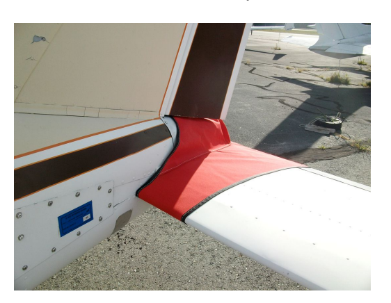
Beech Musketeer Tailcone Cover (Fully Enclosed)

WINTER USE MATERIAL - Made with Solution-Dyed Polyester fabric, this option is intended for seasonal use to aid in deicing, rain mitigation, or for occasional travel. The material is lighter and more compact, but more susceptible to UV damage and may have a shorter useful life if used continuously outside than the all-year use material.