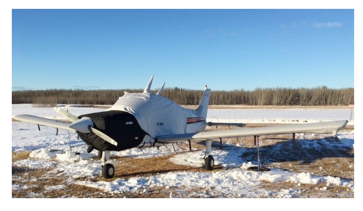
Beech Sport Insulated Engine Cover & Winter Cover Set