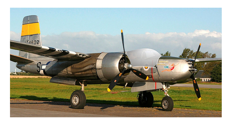
A-26 Invader Cockpit Cover (Illustration)

the hottest of days. It is water, ice and snow repellent, yet breathable to allow moisture to escape from between the cover and the aircraft surface.