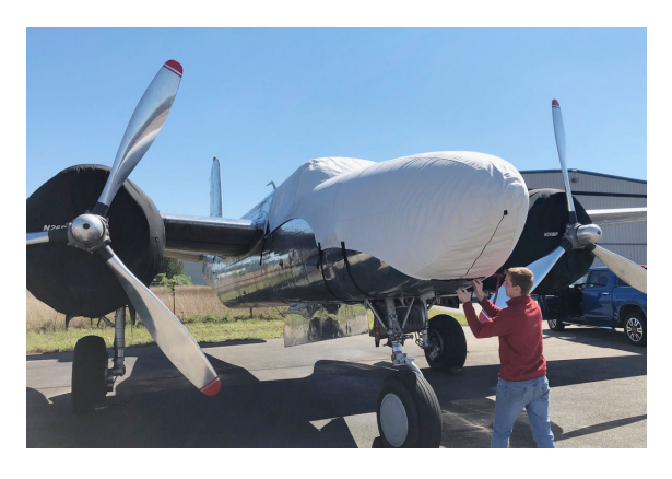
Douglas A26 Invader Cockpit/Nose Cover