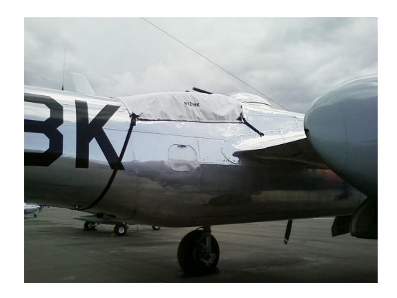
Douglas A-26C Gunner's Area Cover