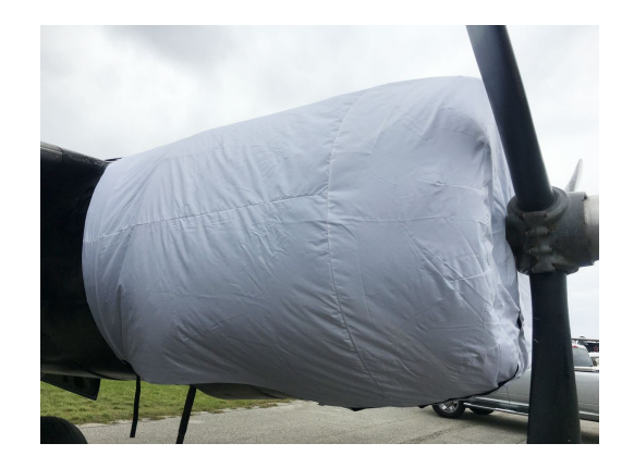
Douglas A-26 Engine Cover, test fit cover