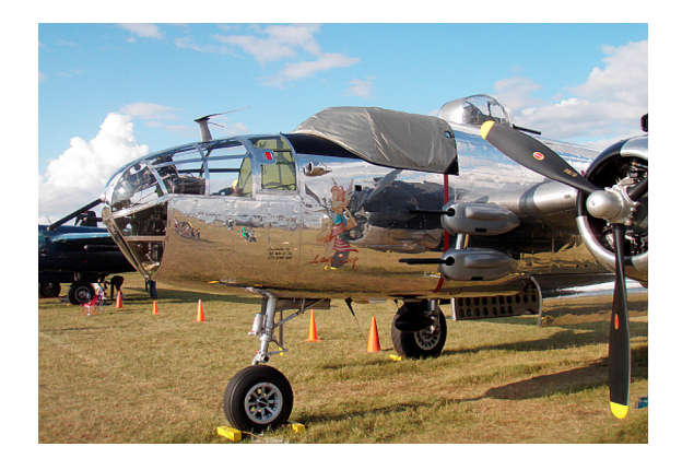
Mitchell B25 Cockpit Cover (Snap-On Type)