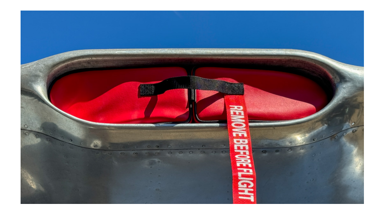
Douglas A26 Invader Oil Cooler Inlet Plugs

Engine Inlet Plugs are custom fit for your Douglas A26 Invader intakes, made with heavy-duty vinyl material, and stuffed with a single block of sculpted urethane foam. Each plug has a zipper that allows the foam to be removed and dried if necessary. Engine plugs have warning flags that are visible from the cockpit or 'remove before flight' streamers sewn onto the face of the plugs. Most plugs are imprinted with the aircraft registration number in black for an extra charge. Storage bag NOT included. Engine plugs may be inserted after flight when the engine is still warm. Engine Inlet Plugs are commonly referred to as Cowl Plugs, Intake Plugs, Cowl Blocks, Engine Blocks, and Engine Bungs.