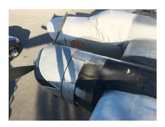
Douglas A-26 Cockpit/Nose Cover