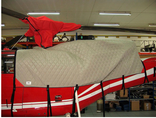
Alouette III Rotor Hub Cover, Insulated Engine/Transmission Cover

WINTER USE MATERIAL - Made with Solution-Dyed Polyester fabric, this option is intended for seasonal use to aid in deicing, rain mitigation, or for occasional travel. The material is lighter and more compact, but more susceptible to UV damage and may have a shorter useful life if used continuously outside than the all-year use material.