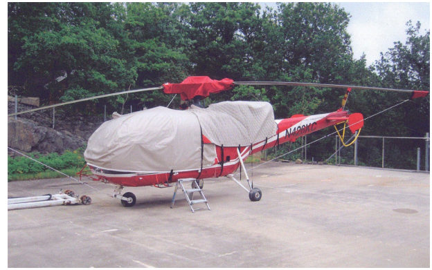
Alouette III Bubble, Rotor Hub & Engine Covers, Blade Tie-Downs