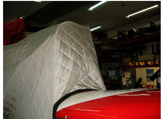
Alouette III Insulated Engine/Transmission Cover