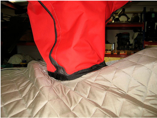
Alouette III Rotor Hub Cover & Engine/Transmission Cover

WINTER USE MATERIAL - Made with Solution-Dyed Polyester fabric, this option is intended for seasonal use to aid in deicing, rain mitigation, or for occasional travel. The material is lighter and more compact, but more susceptible to UV damage and may have a shorter useful life if used continuously outside than the all-year use material.