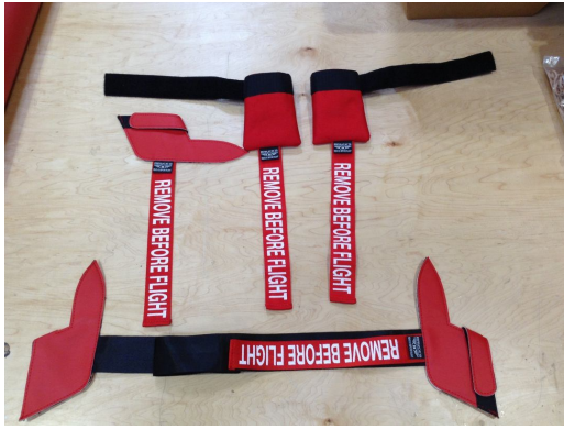
Airbus A319 Pitot & Tat Covers, Heat Resistant Type

registration number in black for an extra charge. Exhaust plugs may be inserted soon after flight when the engine is still warm. Engine Inlet Plugs are commonly referred to as Cowl Plugs, Intake Plugs, Cowl Blocks, Engine Blocks, and Engine Bungs.