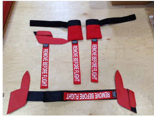
Airbus A319 Pitot & Tat Covers, Heat Resistant Type