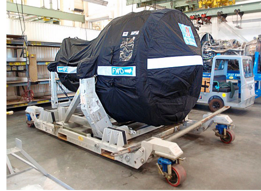
QEC OFF-LINK JET ENGINE COVER, V2500 Series, fully enclosed