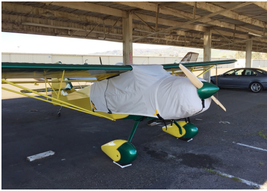
Kitfox Canopy & Engine Covers