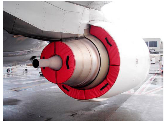
Boeing 737 Bypass and Exhaust Plugs