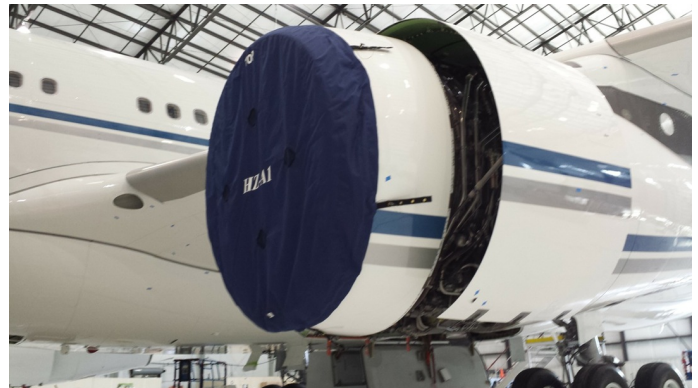
Airbus 340 Intake Covers